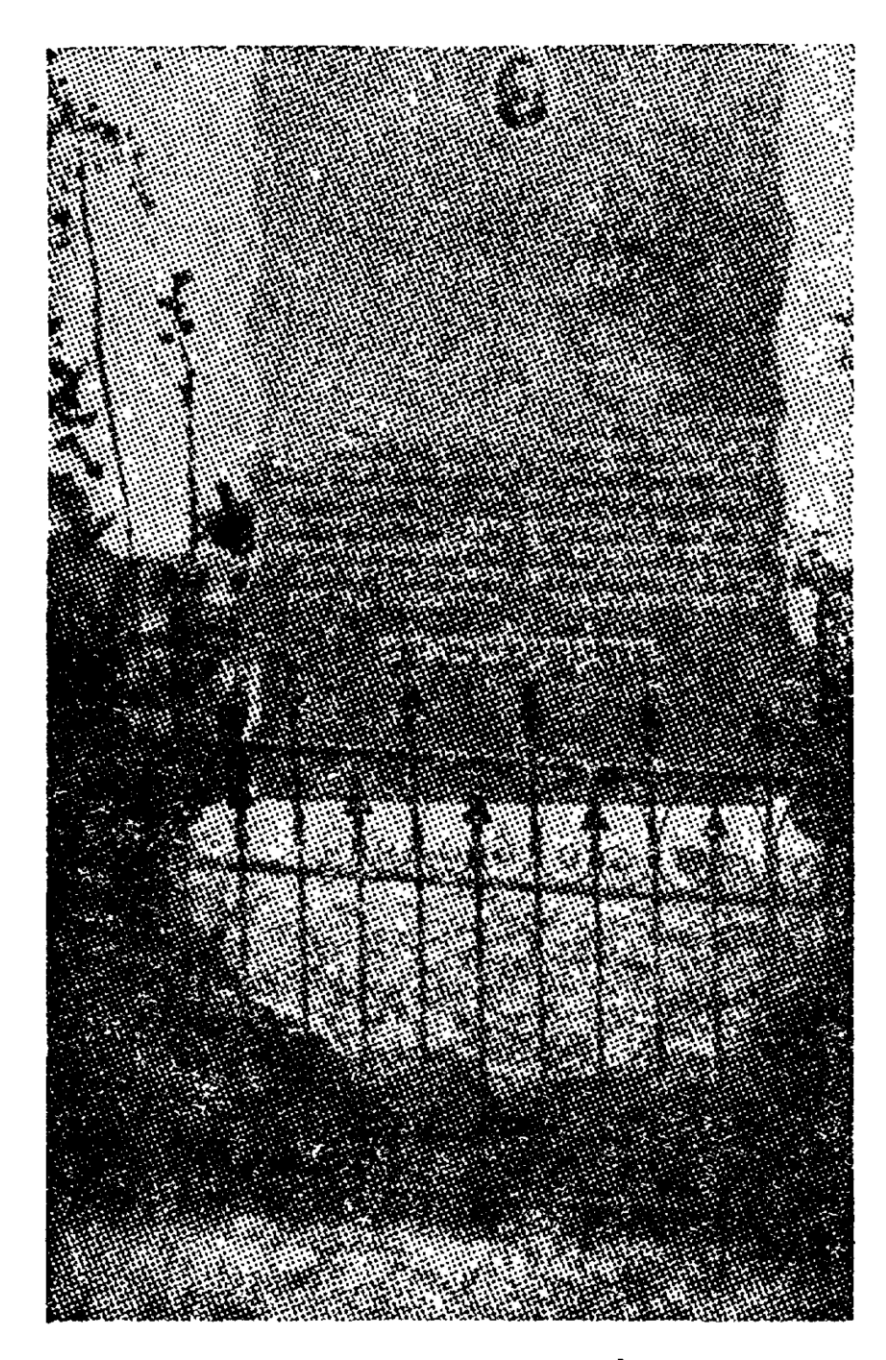
דוד עדעלשטאַטס קבר מיט מצבה אין לענוער) אין דענווער)

Dovid Edelshtat's grave (Workman's Circle Cemetery in Denver)