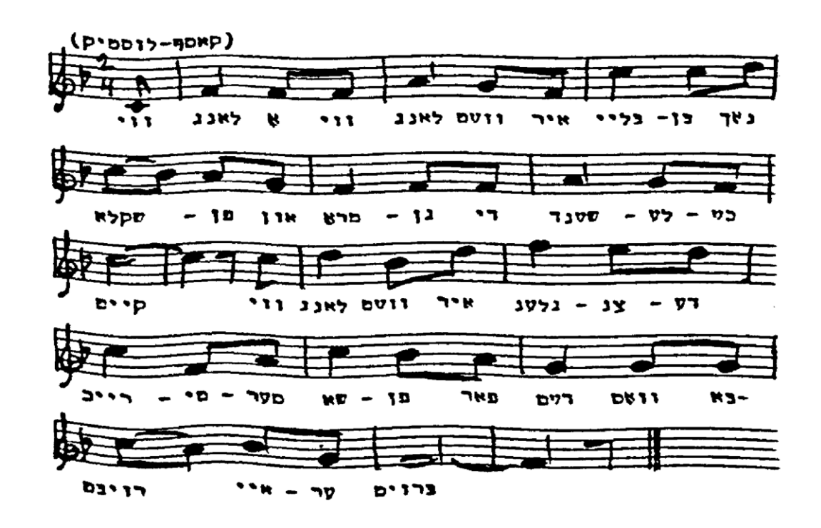
Example 9: "Vakht oyf!" from Bialostotzky (1952:406)