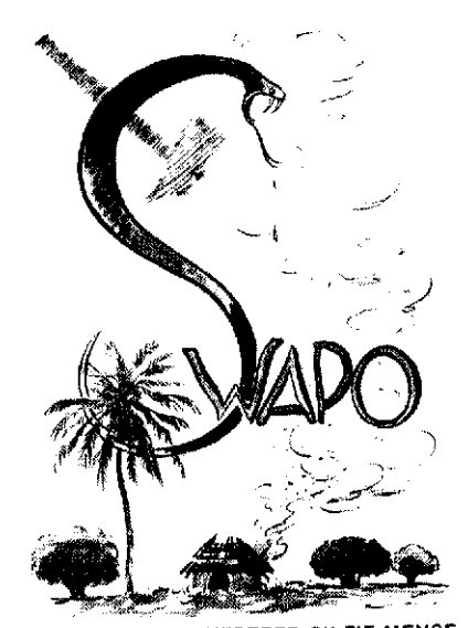
DIE SWAPO VLAM VERTEER SY EIE MENSE

One index of South Africa's future intentions may be its continued program of voter registration. Such registration, without UN supervision, indicates Pretoria's determination to control the outcome of any elections. As reported in Southern Africa last month