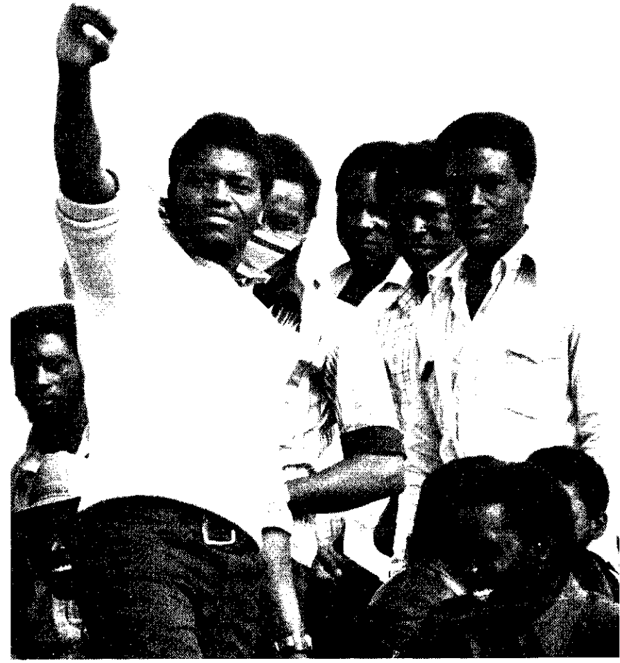
Walvis Bay cannery workers salute SWAPO