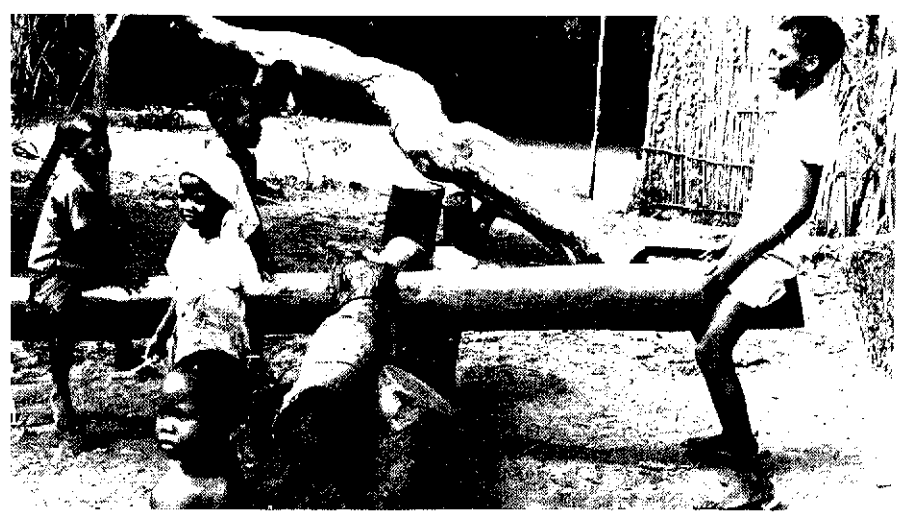
Children's playground - making use of what's available

Efforts have therefore been launched by the government to up-