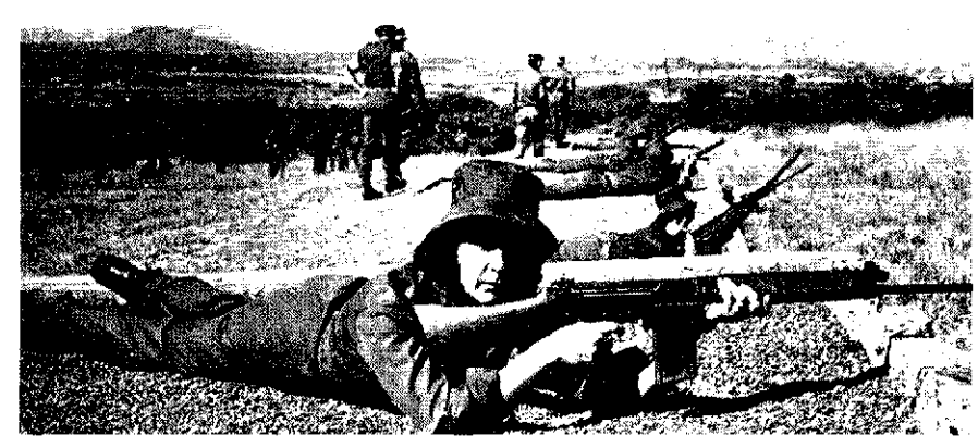
Military training for women in a country that still regards them as the "weaker" sex means only one thing: fear of being overwhelmed by the liberation forces.

An honest appraisal of events during recent months cannot dismiss the genuine damage inflicted on the liberation struggle a year ago. The murder of a leader who had sought to avoid