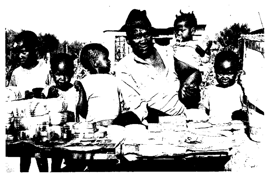
Roadside grocery store: Demolition will break up families

of family housing despite the shortage that already existed. Even so-called "single" men's accommodation has only been increased by one third since 1966. At least 250,000 "colored" South Africans are also now living in 47 squatter camps around Cape Town, because no housing has been built for them. As long as the economy was booming, squatter camps such as Crossroads were allowed. But now that recession has set in and black unemployment is growing, they are no longer tolerated.