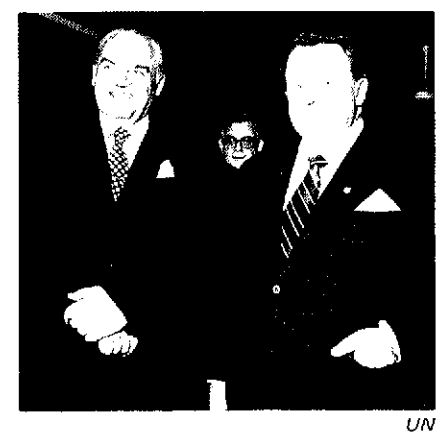
UN Commissioner Antisaari (right) poses with South Africa's Administrator, Steyn

There are two minor coalitions of even more minor parties in the Namibian political arena—the Namibian National Front (NNF) and the Action