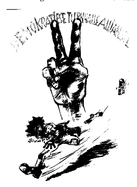
DTA propaganda poster plastered around Windhoek

South Africa counter-attacked, first using long-range artillery to shell Zambian villages across the border and