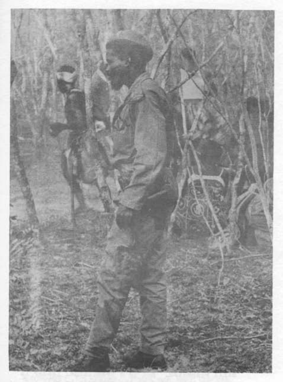
Commander Monimambu, watching play presented by Center for Revolutionary Instruction (CIR) - presented at the First Eastern Regional Conference of the MPLA, August 1968.