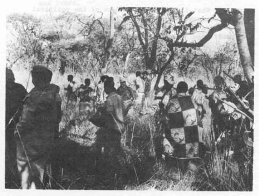
MPLA guerrillas meet villagers and Popular Militia members