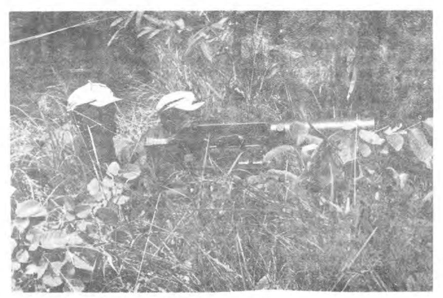
Frelimo guerrillas waiting in ambush.