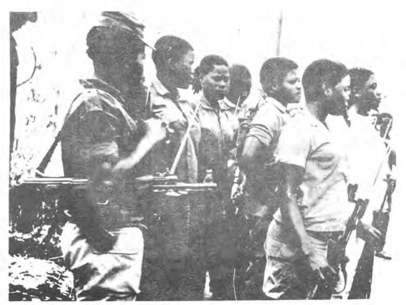
Members of the Women's Detachment, Niassa Province.