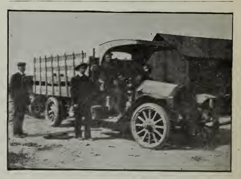
Truck No. 1 has made a remarkable record for runs between Los Angeles and the rancho at Llano del Rio. It has carried several tons of machinery and supplies in trips over mountain passes and "wash" roads that have thoroughly tested its capacity and it has stood up well. Auto trucks will play a great part in the development of the transportation system between the colony and the railroads and cities.

Members of the board who are elected by the stockholders to serve for a period of one year, will have supervision and control of the development of the