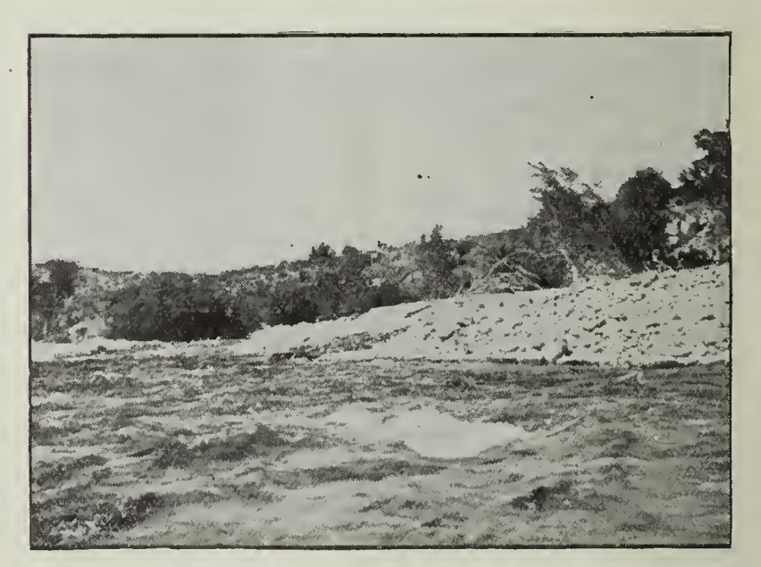
View of Rock Creek which is the source of a large part of the water supply for the Llano country. This photograph was taken early in the season and at that time 40,000 miners inches of water was flowing in the river. With the conservation system planned engineers say it will not be difficult to supply a steady flow of about 20,000 inches of water or enough to irrigate twice as much land as the colony expects to acquire. The source of this stream is high in the mountains where the snow lies in the deep canyons nearly the entire year.

Hitherto the approved custom in agricultural and horticultural pursuits has been to spend a large amount