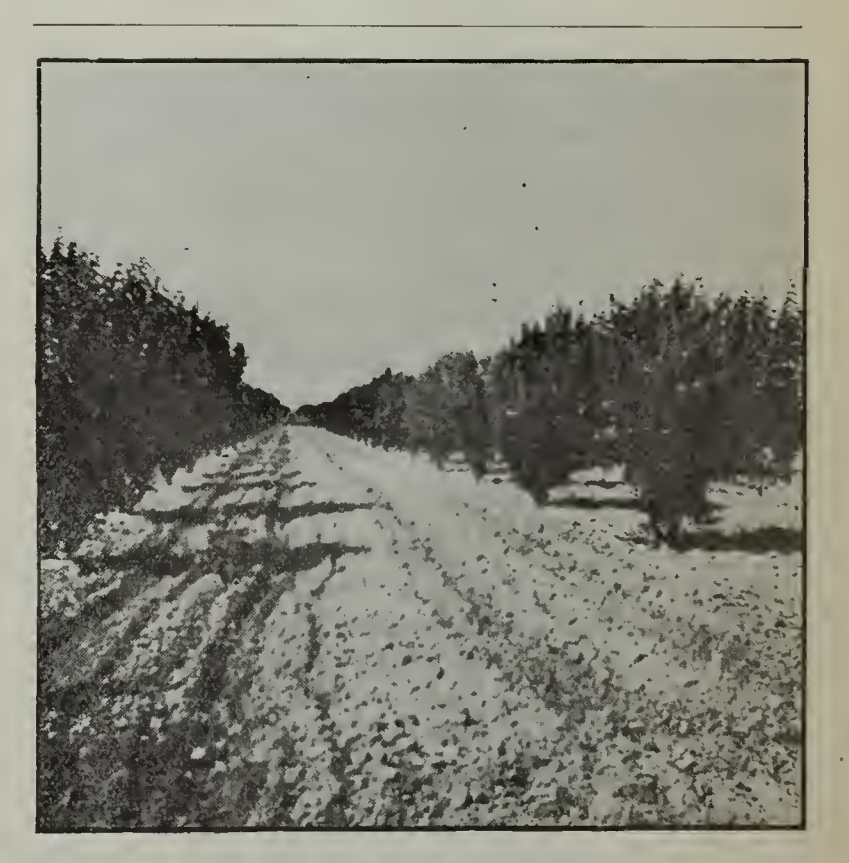
Three-year-old pear trees. Part of a 600-acre orchard near the Llano del Rio colony lands. The soil is identically the same and is adapted to the growth of deciduous fruits. It is the intention to plant thousands of acres in fruit trees. The soil here shows it is furrowed and prepared for irrigation. An abundance of water is available for this purpose.

on a stalk and shakes forth a shower of gold that floats lightly down the hillside on the scarcely moving air. The eye is drawn onward across the valley that lies spread like a great cloth of gold tinted green. One can trace the course of the streams by the bright green trees and the thriving ranches that lie "under the water" on the higher mesas nearer the hills. Across the