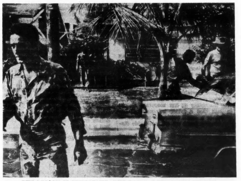
THE LESSON IS UNLEARNED, THE FOLLY GOES ON IN FLORIDA Volunteers of the so-called Intercontinental Penetration Force (Interpen) leave their training headquarters in Miami for a secret training area in the Florida Everglades, preparing for a new invasion of Cuba

Raul predicted further armed attack by the imperialist forces and the use of every possible device to divide the revolutionary ranks. The revolution, he said, must be "flexible but severe" with its enemies, for "this is a war to the death and we know it."