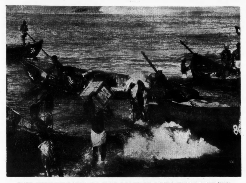
ONCE THEY UNLOADED BY SURF BOATS AT ACCRA HARBOR (ABOVE) Today machines and cranes do the work faster and cheaper (below)

Help your friends become as informed as row are-send them a sub-$1 for 13 wks.