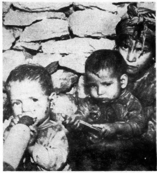
SYMBOLS OF THE REFUGEES PLIGHT Aid came too late to save the twins

From time to time, there will be more . .' "Here is one from New York: 'We should like to know how much money you need to help the Algerian refugees. We can send more and can call on oth-