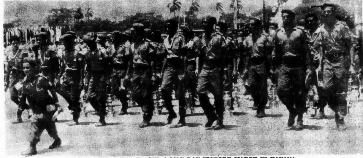
CUBA'S MILITIAMEN STAGED A MAY DAY VICTORY MARCH IN HAVANA They missed the CIA cue and didn't throw away their rifles

leave Florida. About 5.000 Cubans signed up for the