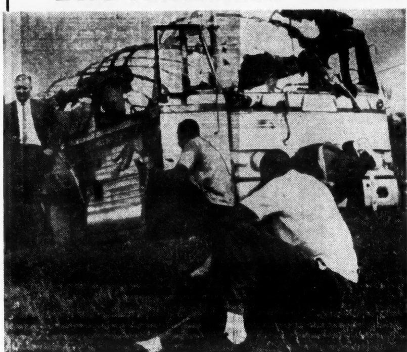
THE BURNED-OUT HULK OF THE BUS ATTESTS TO THE RACISTS' FURY Freedom riders recovering after the mob onslaught at Anniston

The following eyewitness account of the white mob attack at Anniston, Ala., May 14, on the integration "Freedom Riders" was written by a Southern newsman. His name is withheld for his protection.