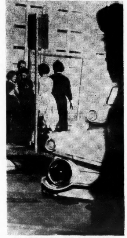
IN THROUGH THE SIDE DOOR

In the past five years New Orleans has quietly accepted integration of city buses. the public library and all public recreation facilities. But school integration was where the Deep South decided to make its stand, and since New Orleans is the first Deep South city to desegregate public schools there is undoubtedly much pressure from other states. There is also