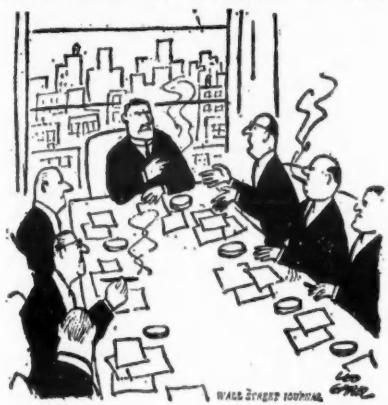
"But I tell you our product just isn't good enough for a thirty-six month payment plan!"

Business inventories are now higher than at the onset of the 1957-8 recession. Unless sales rise sharply within the next few months, inventories will have to be cut drastically. Sales are not likely