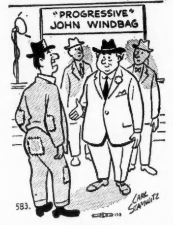
"I'm one of your unemployed constituents, Senator—with the accent on the 'stitch'!"

This drop in capital spending, if it materializes, will not only hurt the machine tool industry, the steel industry, the construction industry and a host of