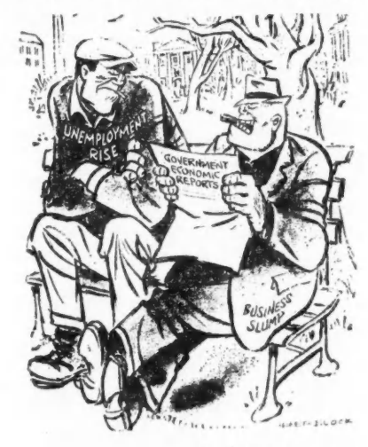
'Guess what-we ain't imaginary characters after all."

The boom generated by the Korean war lasted until the summer of 1953. There seems to be little doubt that the Korean war, while not starting the recovery from the 1948-49 recession, helped