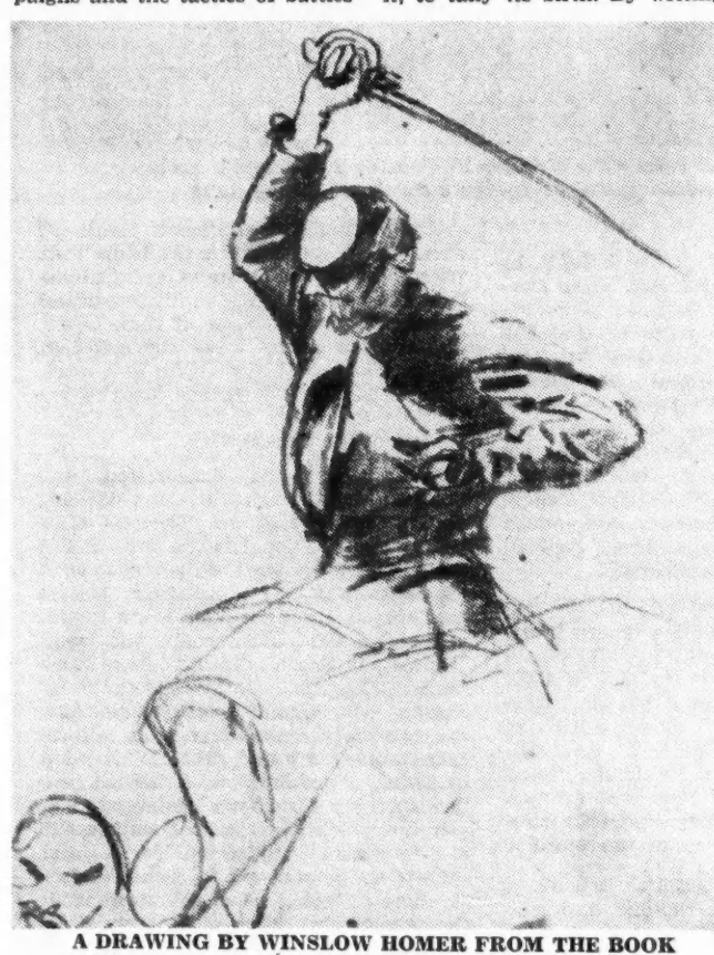
There are 16 pages of drawings by the great artist

This advertisement is submitted and paid for as a public service by Lyle Stuart