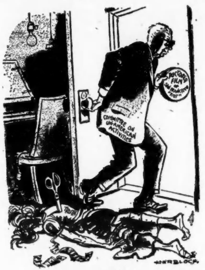
k, Washington Post Cutting-room floor

ROOSEVELT WILL ACT: Protests against the film and against a distorted report on the San Francisco demonstrations by FBI director J. Edgar Hoover are part of a nationwide campaign to abolish the HUAC in which colleges across the country are participating. A petition campaign urging Congressmen to support Rep. James Roosevelt's (D-Calif.) call for abolition, scheduled for the opening day of Congress on Jan. 3. has been undertaken by student groups and by the National Committee to Abolish the Un-American Activities Committee. A New York affiliate, the New York Council to Abolish the Un-American Activities Committee, said it collected more