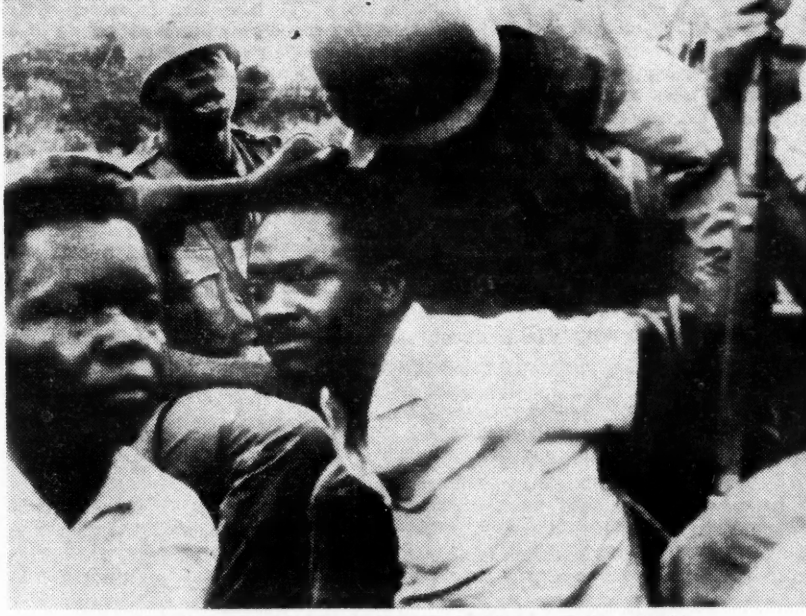
THE END PRODUCT OF IMPERIALISM IN THE CONGO Premier Lumumba, arms tied behind his back, roughed up by guards

The UN resolution authorized Hammarskjold "to take the necessary steps, in consultation with the [Congolese] government, to provide the government with such military assistance as may be necessary until, through the efforts of the Congolese government with UN technical assistance, the national security forces may be able, in the opinion of