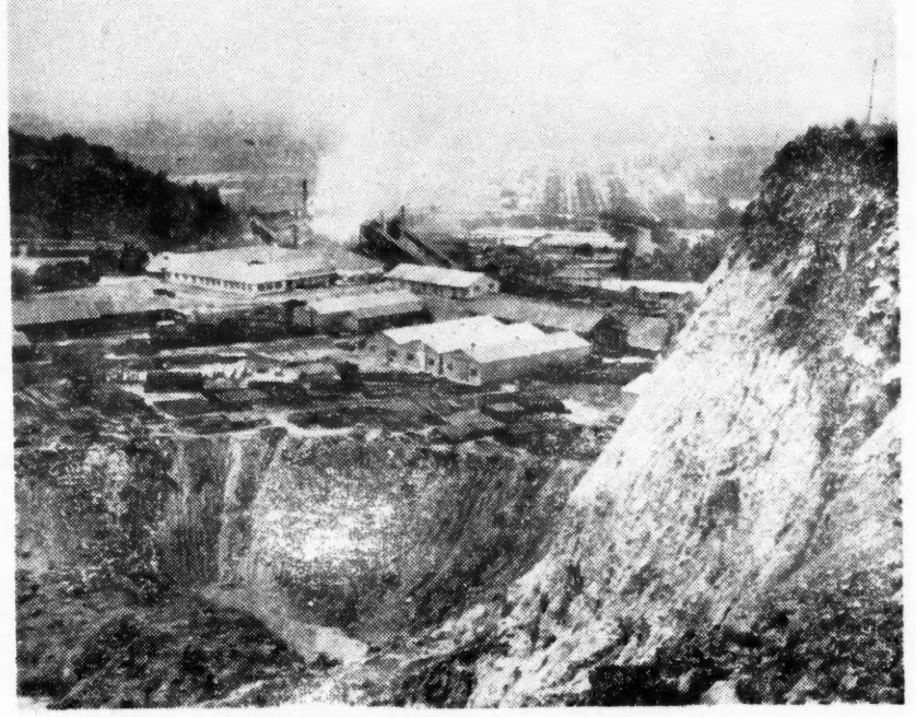
THIS PHOTO TELLS THE CONGO STORY A huge copper melting plant in Katanga Province

to try to hold on to it at all costs. As long as a year ago, according to U.S. News (July 4), "the whites were threatening to break rich Katanga province away from the rest of the Congo and to join white-governed Northern Rhodesia." The Lon-don Tribune referred (July 22) to "detailed [and] long-term talks between the mining interests of Katanga and North-ern Rhodesia." The Tribune cited Western support for Katanga's secession: