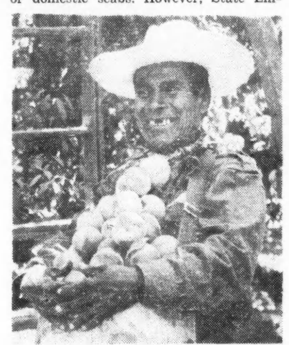
MEXICAN FARM WORKER A pawn in the drive for profit

To counter the strike, the big growers organized a California Farmers Food Emergency Committee to recruit braceros domestic scabs. However, State Em-