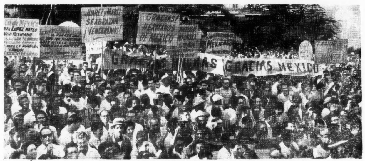
A FRIENDLY CUBAN CROWD DEMONSTRATES OUTSIDE THE MEXICAN EMBASSY Havana was telling of its gratitude for Mexican expressions of friendship

THE ADVANTAGES: In addition to these three basic factors, Cuba enjoys several advantages not usually found in underdeveloped countries: (1) a relatively high per capita income of nearly $400, exceeded only by Argentina ($439) and Venezu-($750) in Latin America; (2) good road and railway communications; (3) a lengthy history of capitalist development;