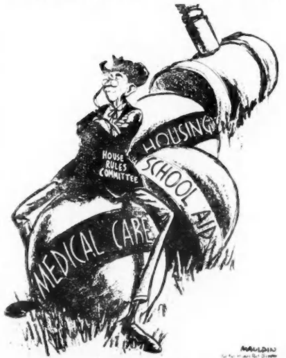
Post-Dispatch Sticky wicket

supply and demand" in the labor market Democrats Holland (Fla.).