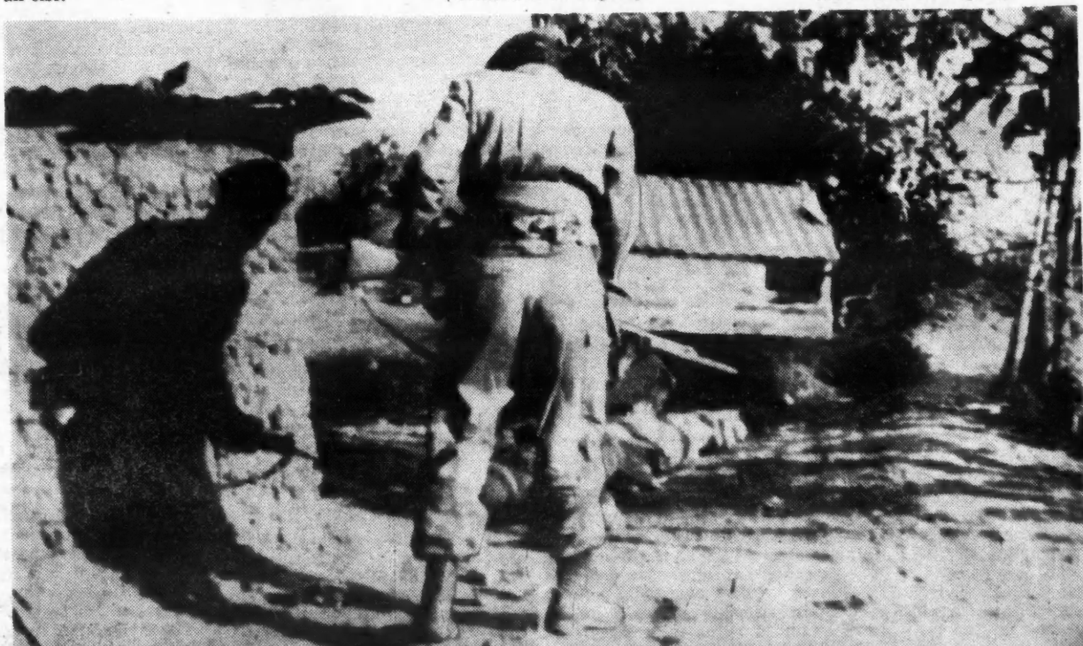
THE WHITE MAN (BELGIAN) UNSHOULDERS HIS BURDEN (CONGOLESE) IN AFRICA A soldier cautiously inspects the body of a Congolese "sautineer" after an attack in Katanga