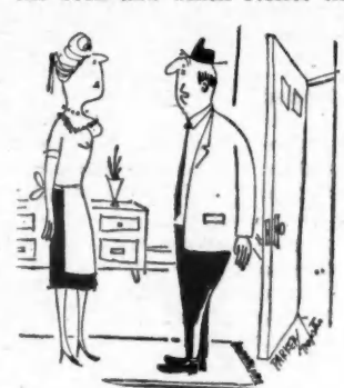
Parker, International Teamster "Well, I met my new foreman to-day . . . It's a 2,000-watt transistorized electronic brain."

It is difficult within the scope of a review to give an adequate description of the wide range of subjects which are presented in the book and which reflect the