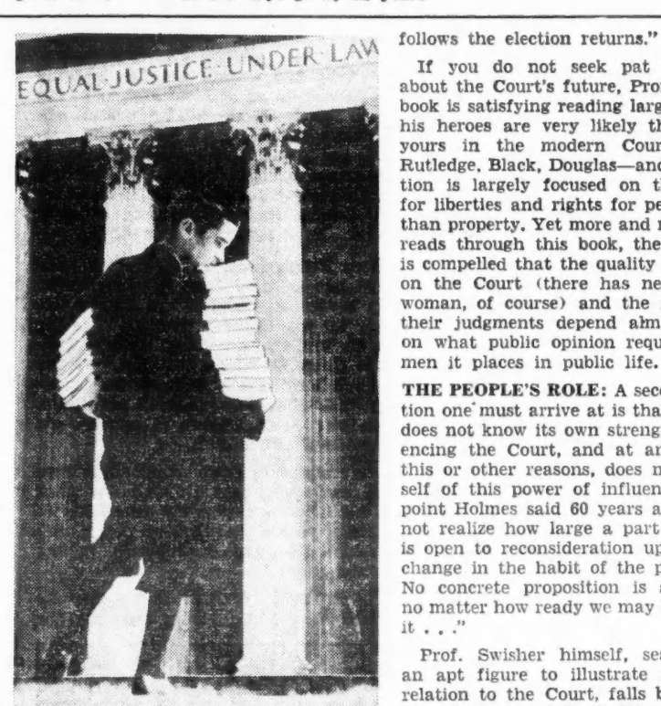
THE SUPREME COURT And a burdened court page