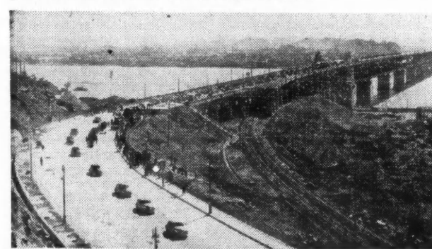
A BRIDGE IN CHINA BUILT WITH SOVIET TECHNICAL AID

Russia has some advantages in this field. Central direction Russia has some advantages in this field. Central direction of her economy is one; recent experience of industrialization under very exacting conditions is another. When India wants, say, a steelworks capable of producing a million tons a year, Russian engineers are likely to have constructed something like it in a district not previously industrialized several times before in recent years. They simply need to adapt existing plans and do not have to start from scratch.