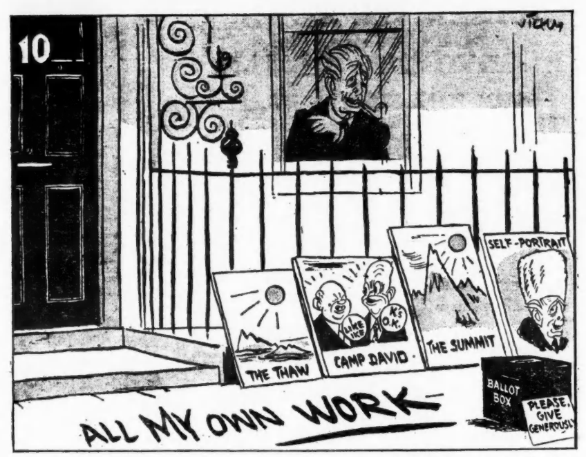
Vicky, London Evening Standard

"It is hard to believe the people of the state will permit this destruction of their precious Bill of Rights which so emphatically upholds the rights of conscience and freedom of association."