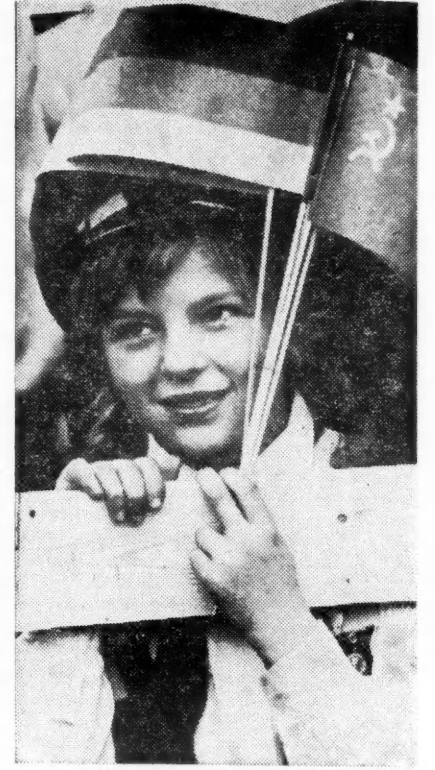
A DAY AT THE FAIR A little German girl in Leipzig

A two-week vacation in a trade union resort costs the average earnings for 13 hours' work. In the area of religion so earnestly used for Western propaganda against socialist countries, East Germany claims 29 freely-functioning denomina-