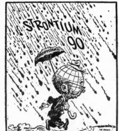
NOT MUCH PROTECTION

report said that if tests were conducted during the next two generations, or even for a shorter time, "following the same pattern as the past five years . . . a hazard to the world's population could result during this period."