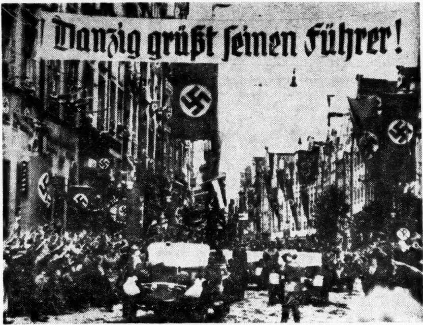
A 20-year-old reminder to the statesmen of the world

This was the Fuehrer's arrival in Danzig, September, 1939