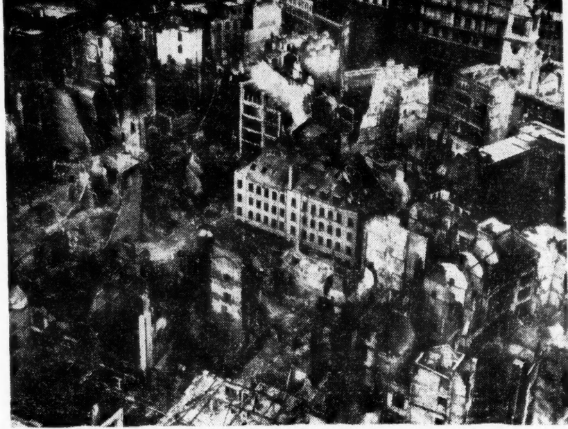
This was the view from St. Paul's in London two ears later