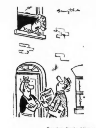
"I'm the party she belongs to!"