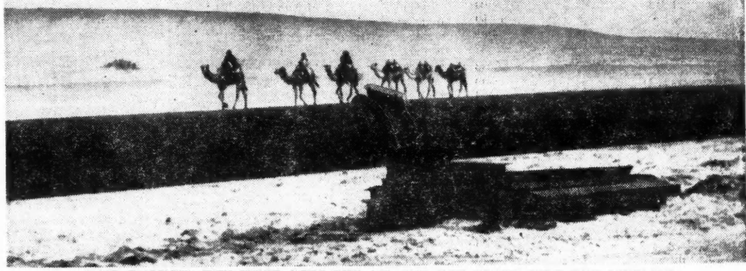
FAIR ENOUGH: THE WEST GETS THE OIL AND THE ARABS RIDE THE PIPELINE Iraqis last week took the first step along a new road

Today, the intervention which has started in Lebanon and Jordan, if it blazes over into Syria and Iraq. might be the beginning of a long protracted Algeria-type war—if not the atomic end of life on our planet.