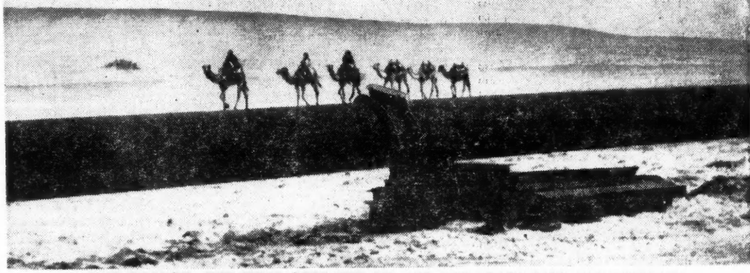
FAIR ENOUGH: THE WEST GETS THE OIL AND THE ARABS RIDE THE PIPELINE Iragis last week took the first step along a new road

Today, the intervention which has started in Lebanon and Jordan, if it blazes over into Syria and Iraq. might be the beginning of a long protracted Algeria-type war—if not the atomic end of life on our planet.