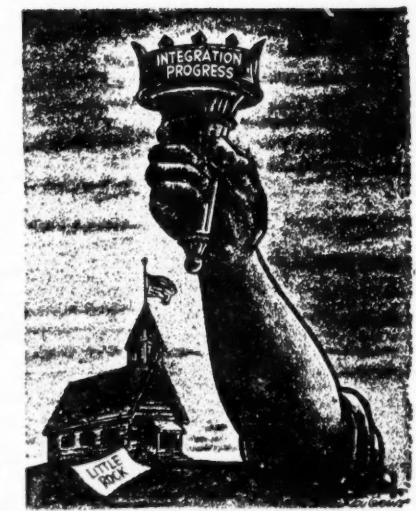
Somebody turned off the light not furthered its claim upon the affection of millions of Negroes.

It is an anomaly that just at the time the fight against segregation has scored some significant victories, a Pan-Moslem movement should arise among Negroes rejecting integration and social equality as a devilish snare and delusion. The fact that the traditional organizations of Negro protest have paid paltry little attention to the critical economic needs of mas-ses of Negro workers could help explain the seeming contradiction. Certainly the NAACP's insistence through all the Cold War years upon giving unvarying unenthusiastic though support to Dulles' disastrous foreign policies has