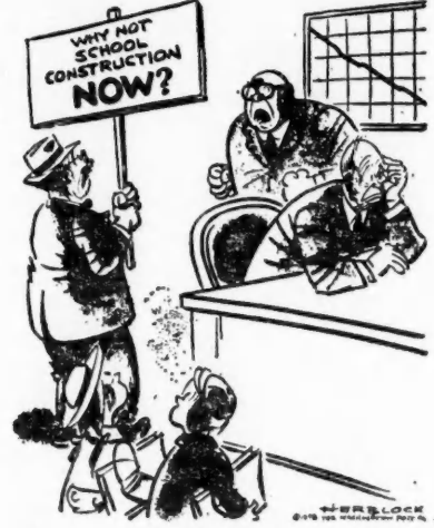
"Qulet! We're thinking up a new reason!"

Our education must be geared to a sounder, more human aim. Our children should be taught science and