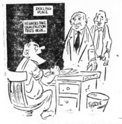
"How many bubbles in a bar of soap?

Wallace was not to be outdone. He had promised to jail any Federal investiga-