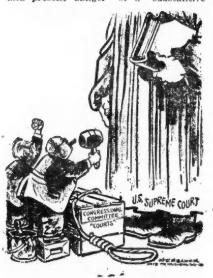
"We'll do all the judging around here."

THIS HISTORIC Holmes breach in the First Amendment dike—that its protections may be waived when a "clear and present danger" of a "substantive