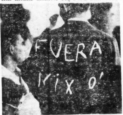
"FUERA" MEANS OUT A very cold shoulder

THEY TURN EAST: Twice in recent months the U.S. has lowered its oil imports and, to protect domestic industry, is considering tariffs on lead and zinc; this means disaster for Peru and Vene-