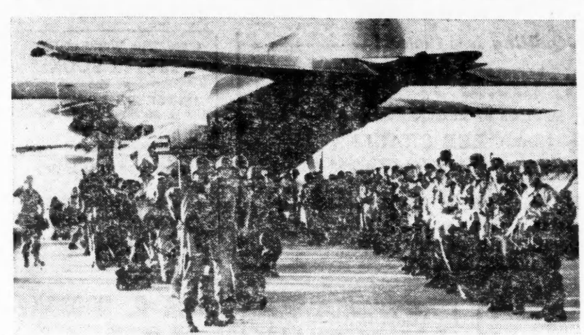
PARATROOPERS OFF TO RESCUE DICK AND PAT Like old times in the Marine Corps