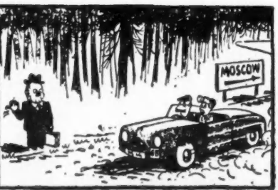
Vicky in London Daily Mirror

Compulsory deliveries of produce from the individual holdings of collective farmers were drastically cut—and the day after the resolution expelling the Malenkov group was published, it was decided to abolish these deliveries completely. Since they accounted for 25% of the meat and substantial proportions of the milk and butter reaching the markets in the past, this was a highly popular decision among the collective farmers. It was made possible by Khrushchev's plan—bitterly opposed by Molotov and some of the other veterans—to plough up 80,-000,000 acres of virgin land in Siberia and Kazakhstan, push wheat production further east and grow animal-fodder crops in the former traditional wheat