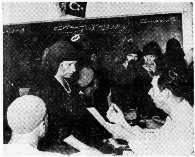
WOMEN VOTING IN THE RECENT ELECTIONS IN EGYPT For the first time in history two women were elected to the Egyptian Parliament. In Syria too women are emerging from the shadows of daily life.

There is, in addition, what amounts to a Western economic blockade. France, normally a big cotton buyer, and Britain have stopped buying altogether while the U. S. is dumping wheat at below world market prices in countries which usually buy Syrian wheat. Egypt has agreed in principle to buy the bulk of Syria's wheat over the next 10 years and Syrians seem confident that socialist countries will buy its products if the West will not. The blockade, however, is especially hurtful because agricultural production this year is the best in history and profitable sales