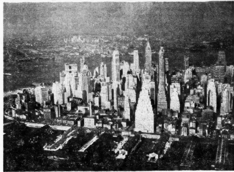
THE BANKS ARE MADE OF MARBLE AND GRANITE AND BRICK The lower Manhattan skyline outlines the nerve center of finance

Perlo defines finance capital as "the linking of banking and industrial mo-nopolies and monopolists into super-monopolies which tower over even the greatest of industrial combines." This volume analyzes the American economy today in a detailed fashion and makes it possible to counter factually the apologists for the financial oligarchy and those who deny its very existence. As such, it is a tremendous help in understanding the nature of monopoly's real threat to the