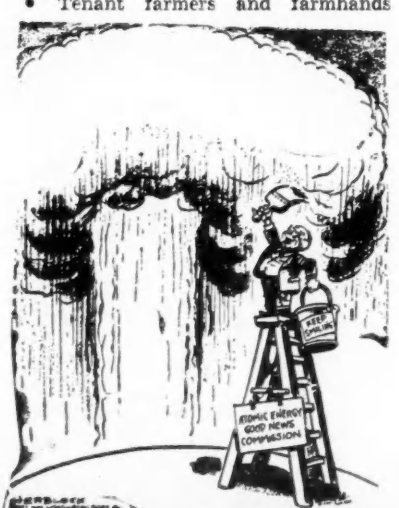
Herblock in Washington Post "I'm painting the clouds with sunshine."