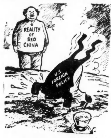
The American Ostrich

RETURN TO NORMALITY? The Chinese CP Central Committee said that the ouster of the four Soviet leaders will "further the unity" of the Soviet CP and