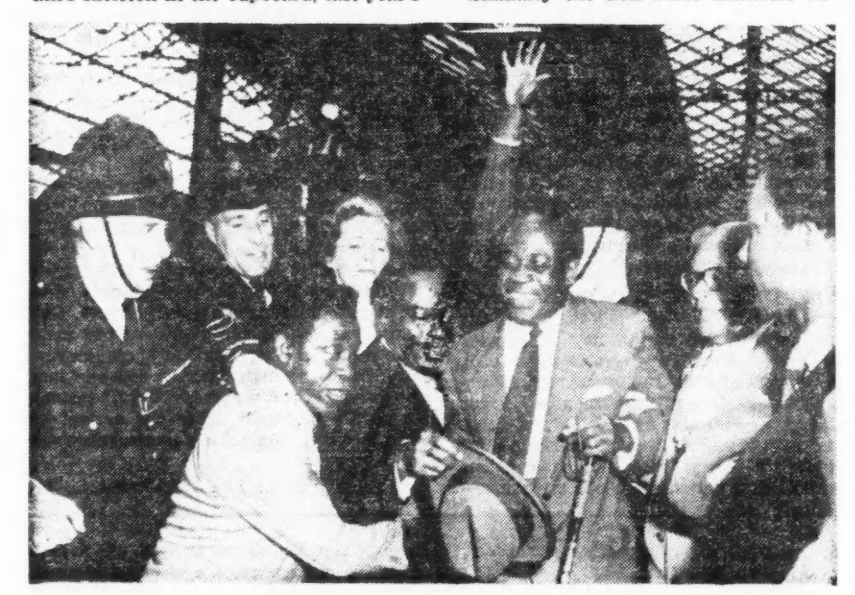
NEWEST COMMONWEALTH PRIME MINISTER IS GHANA'S KWAME NKRUMAH He is warmly greeted as he arrives in London for his first conference.

On one issue, there was hardly any difference of opinion among the Commonwealth Prime Ministers: they all agreed—some rather reluctantly—that the Chinese People's Republic was here to stay, and that Peking must be included in any disarmament agreement.