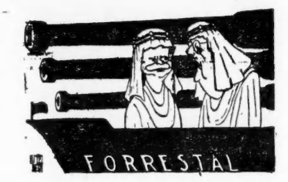
"We will not tolerate Jordanian i ference with our sovereignty."

ho make up the bulk of the population have no organization at all and no laws to protect them.