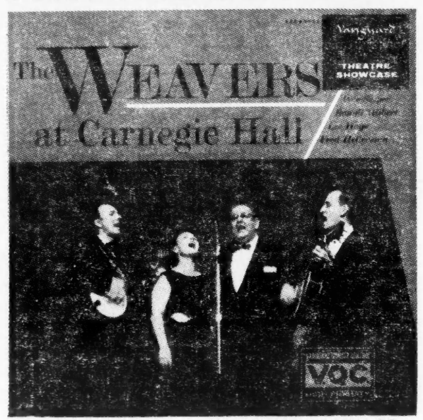
A 12" LP (33 1/3 rpm) VANGUARD ALBUM OF