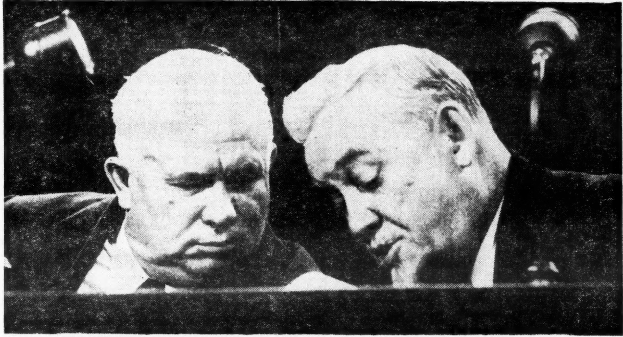
KHRUSHCHEV AND BULGANIN: THE WORLD LOOKS TO MOSCOW FOR THE MEANING The socialist nations appliaded; the neutrals were hopeful; the capitalists were cynical