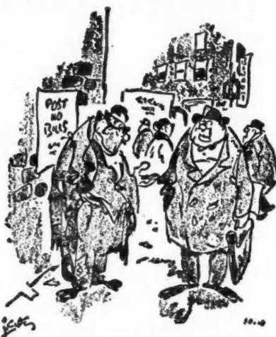
Field Enterprises, Inc. "I can't do much toward keeping the national economy booming with a mere dime, Mac! . . ."

THE ISSUES: The issue before progressives is not whether or not to fight for an immediate program, but rather: what kind of a program for organized