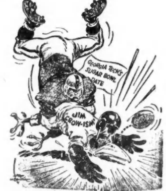
Thrown for another loss!

meetings since the boycott started was jammed by more than 5,000. He said that, "ironically, many of the bus drivers guilty of insulting Negro passen-gers" and siding with the company, "have been laid off on account of the boycott.'