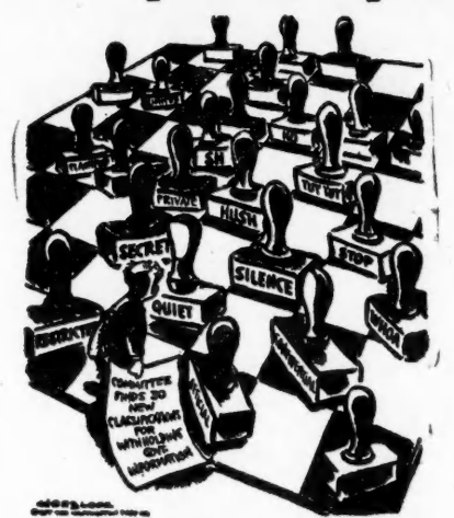
"What is this-a game?

ad been made: "The office of the general counsel of this Dept. has ruled that service for the Communist Party is service in the employ of a foreign government, and as such is not covered by the Social Security Act which excludes service in the employ of a foreign government. In these cases where it is determined that an individual's Social Security account has been credited with earnings from this employment, these earnings will be