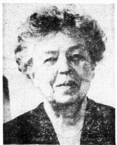
ELEANOR ROOSEVELT In the name of humanity

The petitioners acted independently (their appeal came as a surprise to the Communist Party) and each one signed as an individual. They stressed their