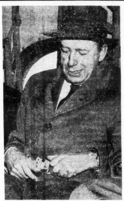
ATTY, GEN. BROWNELL The grim reaper in the middle

GOJACK INDICTED: Both the UE and M-M are under other governmental at-