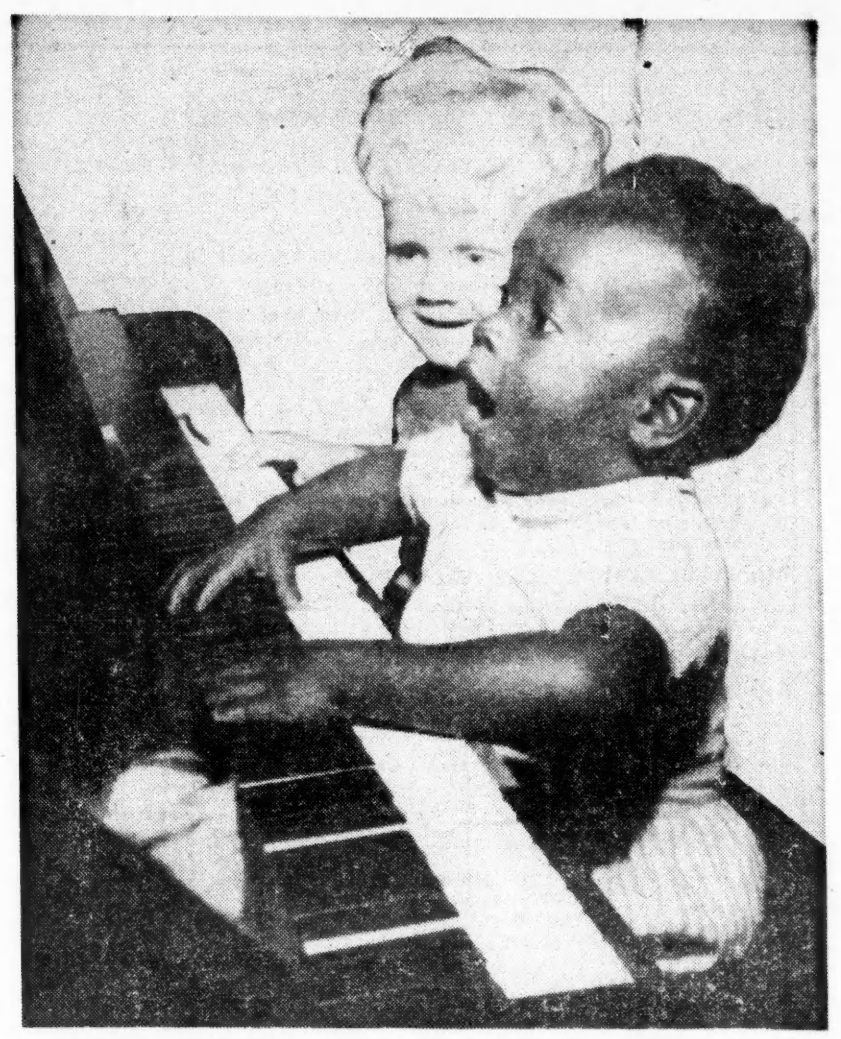
A Happy New Year to All Our Readers