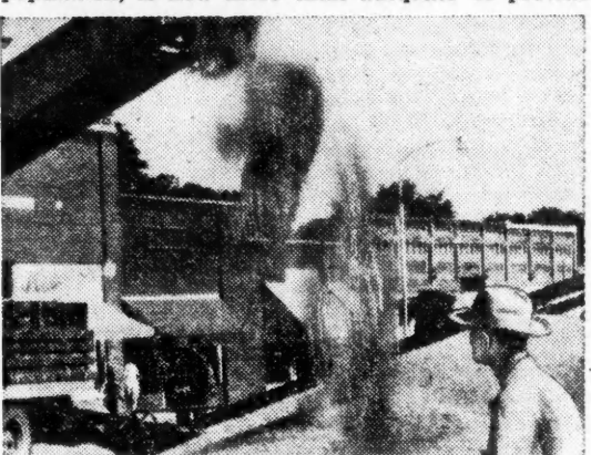
WHEAT IN THE STREET But hunger still coexists with abundance

The American farm plant, with only 1/13 of the population, is now more than adequate to provide