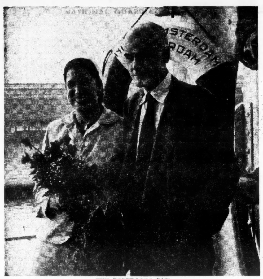
THE BELFRAGES SAIL They'll return when the Walter-McCarran Act goes