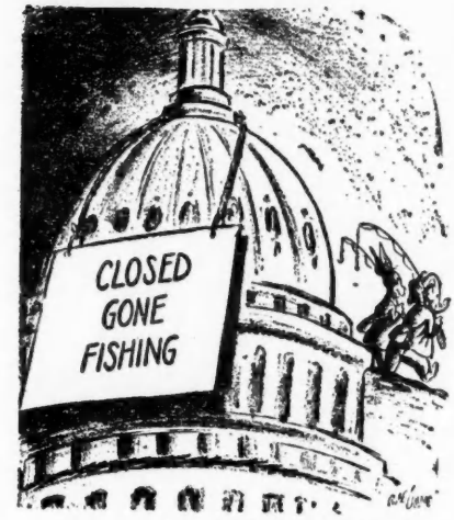
N. Y. Journal American FULL AGREEMENT AT LAST

On civil rights legislation the 84th Congress drew a total blank. Both par-ties reneged on their bright promises. ties reneged on their bright promises. School kids got nothing; they return