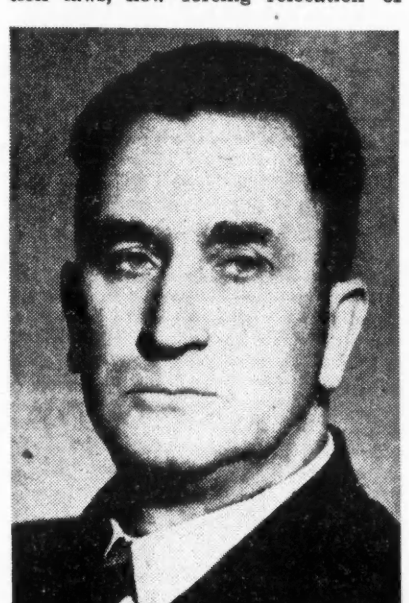
PREMIER STRIJDOM The face of hatred

• Ruthless enforcement of segregation laws, now forcing relocation of