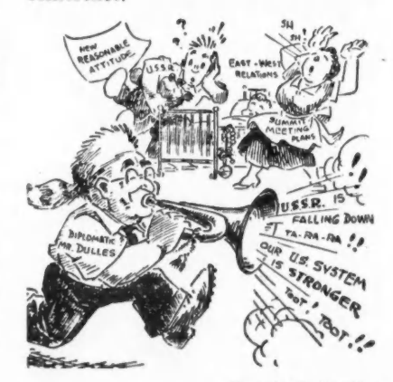
Toronto Dally Star Still blowing his war horn when the world wants peace.

"Obviously, the U.S. cannot refuse to discuss arms limitations. But it can direct . . . discussions so that a limitations agreement—if, indeed, any can be reached—would benefit America more than it would Russia." America more than it would Russia." Whether the President's new fiexibility was merely a tactical change necessitated by Moscow's acceptance of most Western terms on disarmament, or was designed to present new obstacles to agreement, would be shown by the accomplishments of the Geneva conference.