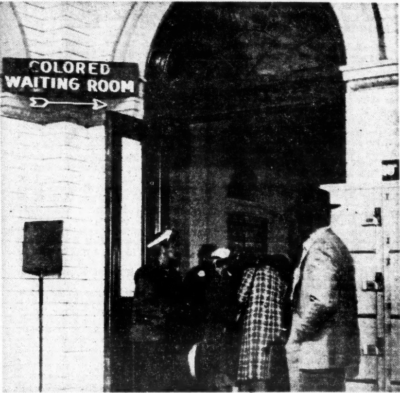
WAITING ROOM IN THE RAILROAD STATION AT ATLANTA, GA.

the law. Recent U.S. Supreme Court decisions "have swept away all support for the 'separate but equal' doctrine even as applied to interstate com-