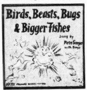
Birds, Beasts, Bugs and Bigger Fishes, Pete Seeger. No. 711 Animal songs for school days