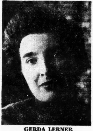
There were no waltzes

QUICKLY, EASILY, you'll play "Joe Hill," "Irene," pop tunes, blues & folk songs with rich chord harmonies—even if you don't know a single note now! Send $3 for Guitar Method to: LORRIE, 241 W. 108 St., N. Y. 25 FREE! "The Weavers Sing," exciting 48 pp. book of folk songs (reg. $1.25).