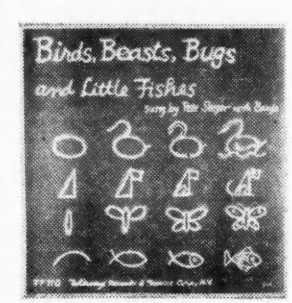
Birds, Beasts, Bugs and Little Fishes. Pete Seeger. No. 710. Animal songs for very young.

such universal charm, adults will find themselves eaves-dropping.