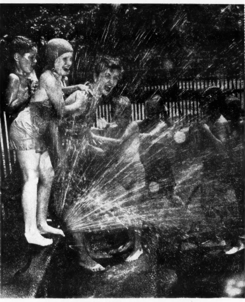
Can anybody think of a better idea?

This was Central Park in New York on July 18, when the thermometer hit 96—and it's been close to that for almost two weeks. As far as we're concerned, you can HAVE July. On Murray St. we try to keep cool by hoping for warmth at Gen