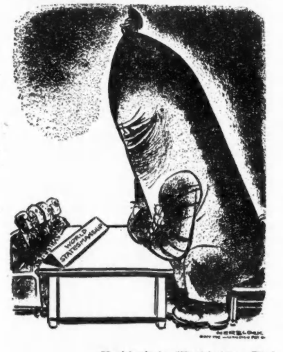
Herblock in Washintgon Post "It's really ally more of a conference, ain't it?

THE BRITISH VIEW: The British, according to Drew Middleton (N. Y. Times, 7/12), saw "Germany as the