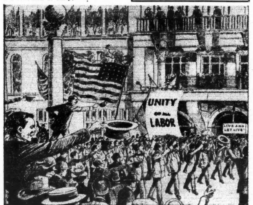
THE DRIVE FOR UNITY IS NOT A NEW THING Print of a 19th century Labor Day parade in Chicago

God rest ye merry "Operation Snowball," a disaster test and a Christmas present of service to the towns of Fairfield County from their Civil Defense organizations, is being planned for [christmas Evel. Convoys of fire fighters; bulldozers, rescue teams, Red Cross units, radiological monitoring squads, mobile food canteens, military and police units are expected to arrive at an undisclosed "Aid Check Point."... Their purpose is to bring support to a bomb-stricken area. Twenty towns will be informed Friday evening . . . of the location of the bombed area and of the name of their emergency meeting place. —Norwalk (Conn.) Hour, Dec. 15.