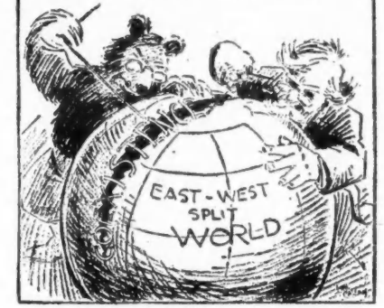
A STITCH IN TIME?

The 84th Congress How it will line up ........ p. 5