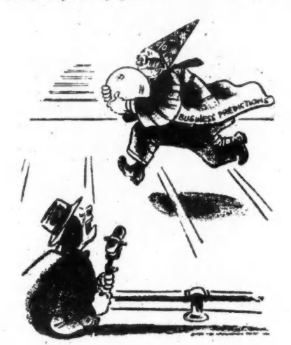
"He's carrying the crystal ball for a gain, folks."

BURSTING COFFERS: To these economic royalists, private investment-at