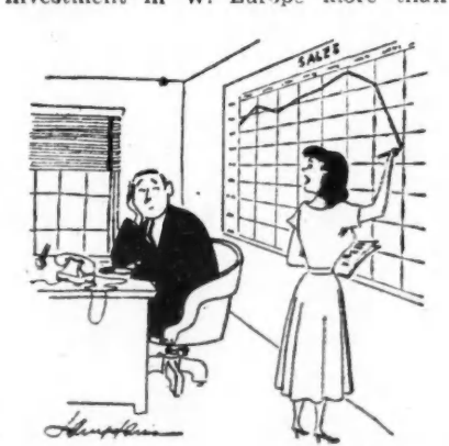
Wall Street Journal How nice, Mr. Prescott! This month I can reach it without standing on a chair."

who AlDED whom? The drive to earn profits of this magnitude lay be-hind the foreign aid program (econ-omic and military) launched in 1946. omic and military) launched in 1946. It has cost taxpayers about $50 billion. Loans to Britain and France, the Truman Doctrine, Marshall Plan, NATO, etc.—all were designed, among other things, to open W. Europe and its dependencies to U.S. capital. In this aim the program was quite successful for the economic royalists. Between 1946 and 1953 their direct investment in W. Europe more than