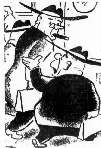
"Just remember our new year's resolution — Let's make the 84th Congress just like the 83rd,"

The AFL Labor's League for Political Education has a slightly different set of figures; in the House it lists 176 members as pro-labor against 235 anti-