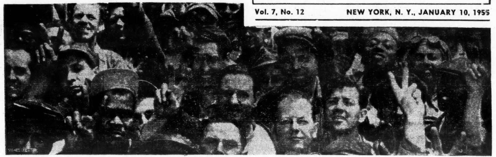
1955-year of decision? It may be for the people of America, and the world.

10 cents NATIONAL the progressive newsweekly