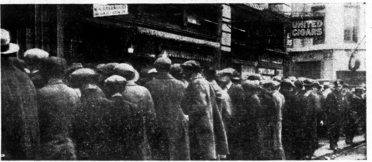
MOST OF US ARE OLD ENOUGH TO RECALL THIS SCENE WITH SHUDDERS line in the Great Depression. It may be back unless sanity returns first

the first response to labor's demands jobs through much-needed peace-construction. But at best it will a year before it gets started, and the big "economy" guns will attempt to demolish it.