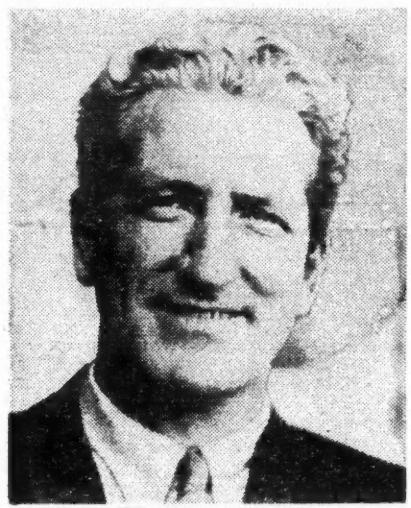
FRANK SCULLY the facts, no room

"patriotic duty?") In fact, the government itself exposed the essential fraud of the case, although only a corner of the curtain was lifted — by the hearing officer's gingerly treatment of it in his decision — on the "George Oakden" hoax