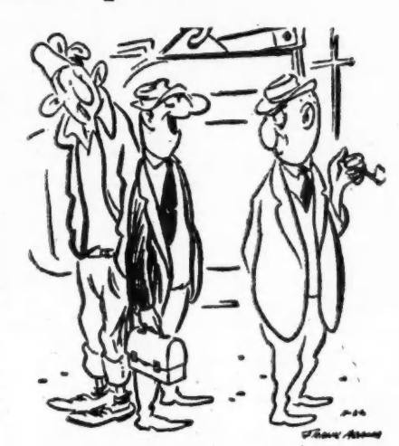
a Angeles Daily News "Had another of those nightmarish weekends, Boss. . . Lost my head again and squandered my whole week's earnings for groceries!"

The rate of profit is beginning to taper off. For all corporations it had, by 1954's 1st quarter, fallen from the 1950 peak back to not much above the 1944 level. One reason is that the 1950 top was achieved by the boom in war orders coupled with lack of controls, orders coupled with lack of controls, immediately following Korea, and could be created only by some big new war move. Another is the present stagnation of the consumer, as well as govern-