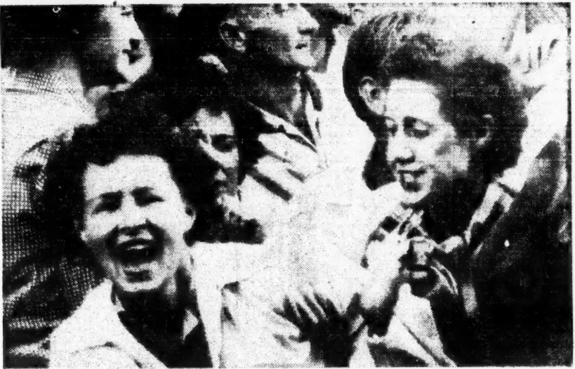
A PICKET-LINE SCENE AT THE SQUARE D STRIKE Politics was forgotten

which may be called by the CIO for further discussion by the representatives of CIO unions from all over the country. And even then the CIO has been, is and will be, a voluntary federation. It compels no organization to stay in it. . . Even then with the program brought in, each union must decide for itself whether or not it will affiliate with that great unified organization. So there are many steps. There is quite a road to go in this unity situation."