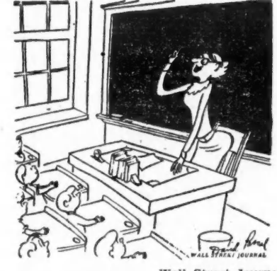
Wall Street Journal "If I had three hydrogen bombs, and gave two hydrogen bombs away, how many would I have left?"