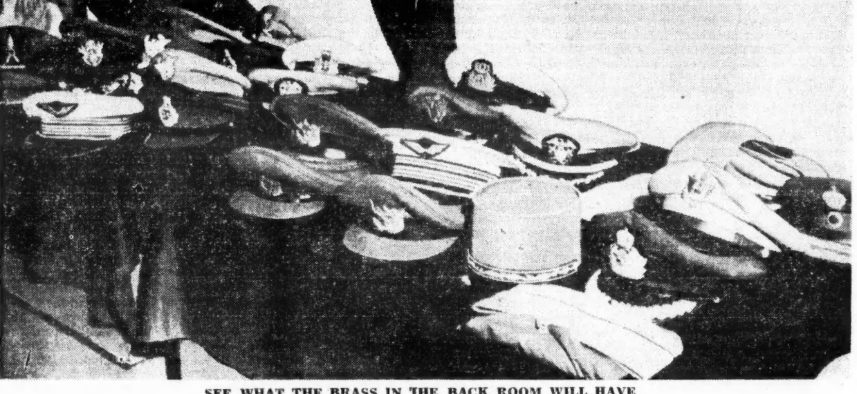
SEE WHAT THE BRASS IN THE BACK ROOM WILL HAVE collection of NATO military hats outside a Paris

Eight years ago U.S. scientist Harold Eight years ago U.S. scientist Harold Urey derided the notion of using the A-bomb to "maintain peace," and said it would be used "only by those who believe that the proper way of settling international difficulties is by resort to war." The A-bomb, he added, is "useless as a police weapon" since a weapon to be effective "for the preservation of order" must be one "which