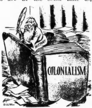
"Now on the last chapter?"

Nationalism are exposed to various and contradictory solicitations on the part of their American advisers. The fact is that in Formosa the U.S. representatives are at the same time diplomats and