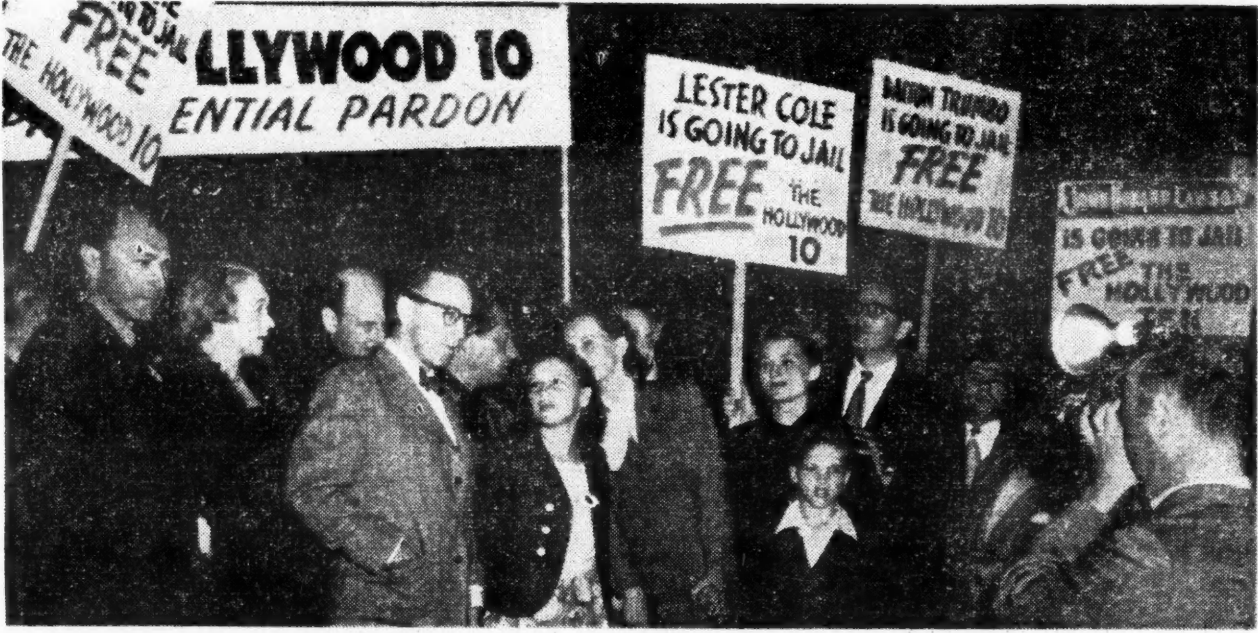
WHEN THEIR FAMILIES SAID GOODBYE TO THE HOLLYWOOD TEN

THE FIRE-FIGHTERS: Driven by the THE FIRE-FIGHTERS: Driven by the simple but powerful turbines of conscience and social responsibility, hundreds of people from lavishly-paid writers, actors and directors to just plain neighbors became politically active. In such groups as the Hollywood Anti-Nazi League and the Committee for Spain they worked together to aid democracy's defense abroad, and in America to draw attention to the inroads being made by fascism and suproads being made by fascism and sup-port the New Deal's measures to extend democracy. In these efforts I was then, and remain now, proud to be associated with good Americans of a dozen political, philosophical and religious shad-