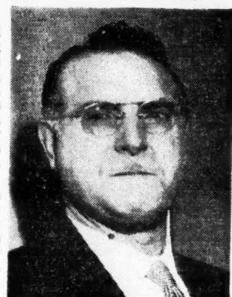
CARMINE DESAPIO Chiefie goes respectable

Tickets: $1:15, $1.70, $2,30 and up at Box Office