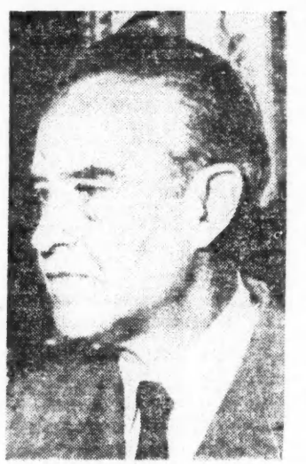
AVERELL HARRIMAN It's an ambush

GOPS ON WHITE HORSES: Taxe. were ticklish, with national elections due in 1956 and N.Y. State one of the most doubtful in the Demo-