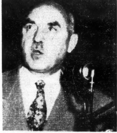
STEPHEN H. FRITCHMAN Investigate the investigators

fessions Council, mentioned by "un-friendly" witnesses as a sponsor of moves against discrimination in hos-pital services, replied that "according to the perverted logic of the Senate Committee, it is 'disloyal' to fight dis-crimination."