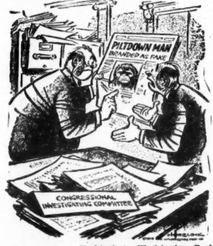
Herblock in Washington Post We can't subpena him. I think he's our staff."