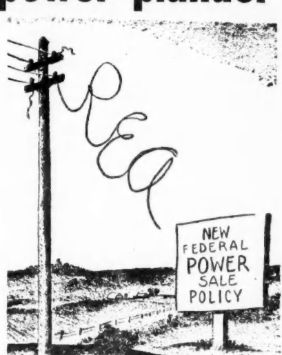
Post-Dispatch END OF THE LINE

BACK TO THE BOYS: On Nov. 3 Mc-Kay told a conference of western gov-ernors at Albuquerque, N. M.: