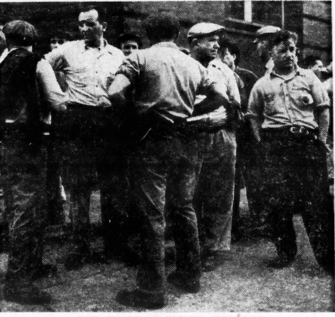
THE SHAPE-UP MOVED INDOORS The bosses were the same, the dockers had no voice

MT. LAKE & STUDIO LODGE— Putnam County, 65 miles N.Y. 50 acres woodland, 3 acre lake, trout stream, brook, fieldstone lodge, 8 rms., yr. round; stone garage, 4 rm. atone cottage. Suitable as is for small resort, camp, hunting or fishing lodge or for colony development. $30,000. Box L. Guardian, 17 Murray St., N. Y. C. 7.