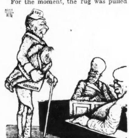
to the Big 3 meeting in

from under Washington's plans by the efforts of Soviet diplomacy to expose the "big lie" that Moscow has rejected negotiations and insists on continued cold war. A new Soviet note on Nov. 27 made headlines and was welcomed in London and Paris "as an acceptance of the . . . four-power conference of foreign ministers and as a basis for a prompt and positive action" (N.Y. Times, 11/28). Even some U.S. officials "felt the Western Big Three now have no alternative but to agree to Russia's bid for a conference" (N.Y. Herald Tribune, 11/28).