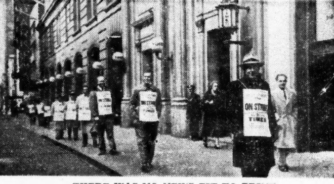
THERE WAS NO NEWS FIT TO PRINT Pickets marching in front of the Times Bldg

Another pamphlet of the Major's, "Usurpation of Power, (Continued on Page N. Y. 3)