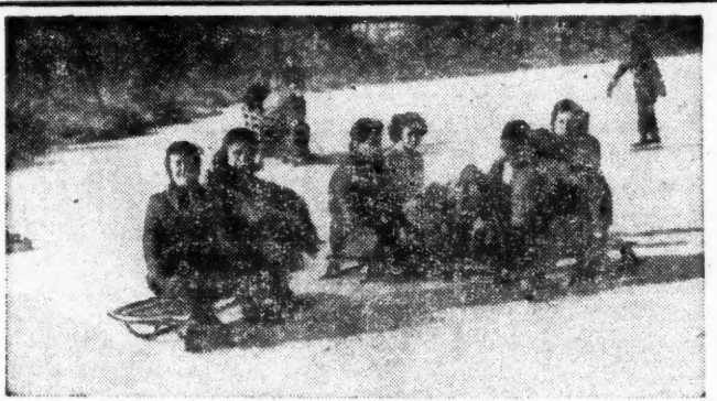
WINTER COMES TO WHITE LAKES The resort is open for the 10-day holiday period

Members, $1; Non-Members $1.25 CLUB CINEMA 430 6th Av. Nr. 9th St.