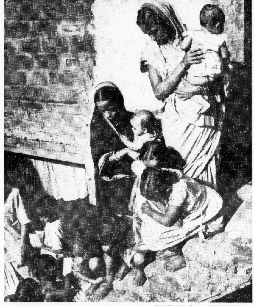
SOMEBODY DOES CARE ABOUT THE ASIAN PEOPLES' REAL PROBLEMS malaria control-watched by Indian World Health Orgn. teams for families (above) as they spray mosquito-breeding areas—only pennies are available while U.S. firms extract billions of dollars from Asia.

For example, Standard Oil of N.J. For example, Standard Oil of N. J. and Socony-Vacuum—partners with British, French and Dutch oil companies in the Iraq Petroleum Co.—originally signed the Red Line Agreement stipulating that any partner getting a new concession, within a line drawn around the entire Middle East including Saudi Arabia, would share equally with the others. During World War II Standard and Socony gained oil equally with the others. During World War II Standard and Socony gained oil concessions in Saudi Arabia, set up Aramco (Arabian-American Oil Co.), later, took in Standard of Calif. and Texaco, but froze out the British, French and Dutch. A measure of Aramco's profits is that, although U.S. and Saudi Arabian oil sell at the same price in the world market, a barrel in price in the world market, a barrel in