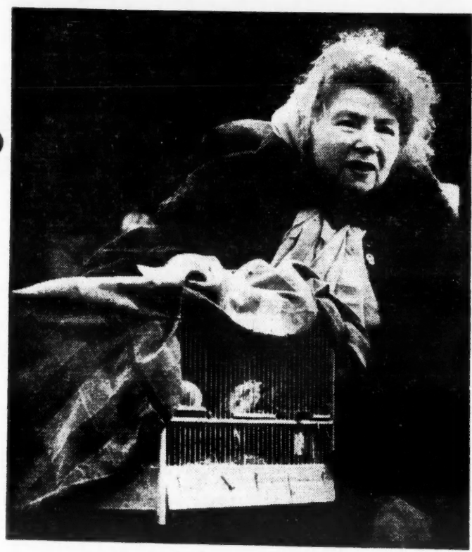
AT ASP PHOTOGRAPHERS' SHOW "Bird Market in Paris" by Robert Folley, in the ASP Photog-raphers' Workshop show continuing at ASP Clubrooms, 37 W. 64 St.