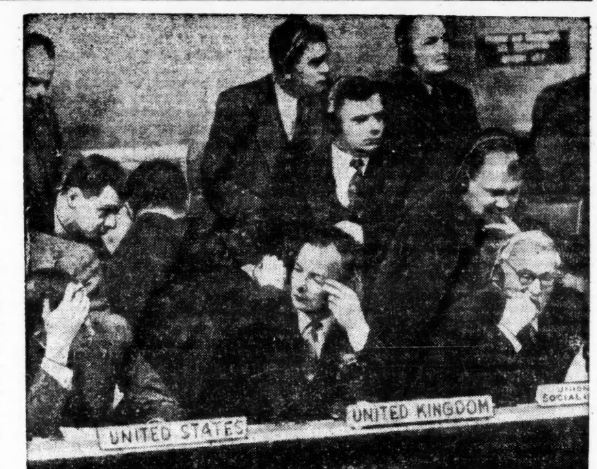
IT'S ASPIRIN TIME IN PARIS The puzzle: Find a happy face

"The next item on the agenda is the U.S. delegate's proposal that in order to secure uniformity and eliminate friction all Canasta cards should be of American manufacture."