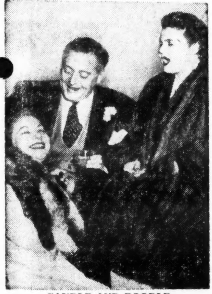
CAUDLE AND BOODLE Say, who's that mink I seen

float for Pasadena's annual New Year's Day parade that precedes football's Tournament of Roses. The float would present at one end a youngster behind a haberdasher's counter, gazing at a floral design of the capitol; at the other the youth, grown older, thumping a piano before a White House backdrop, with clusters of girls in mink coats