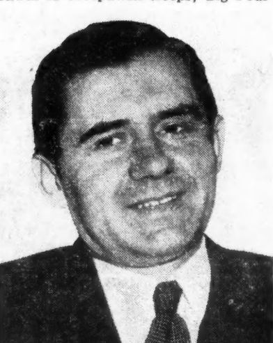
ANDREI GROMYKO A disarmed Germanu?

REARMING IS SACRED: At the Big Four deputies' conference in Paris, the U.S. delegation stated its aims less frankly, but correspondents said the U.S. would make no concession that would affect its arms program. Soviet Deputy Foreign Minister Gromyko suggested this agenda for the proposed foreign ministers' conference: fulfillment of the Potsdam agreement on Germany's demilitarization, a peace treaty with a united Germany; withdrawal of occupation troops; Big Four