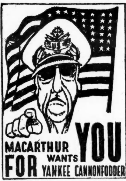
English anti-war poster.