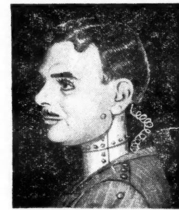
THOMAS E. DEWEY The parts are rattling

The Bill would in effect substitute a governor-appointed Defense Council for the Legislature in time of "any attack, actual or imminent." The Gov-