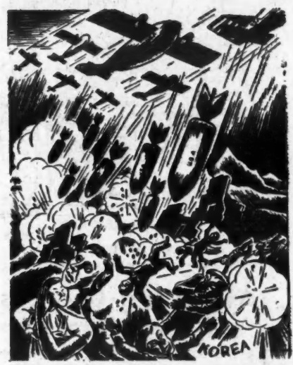
Yankee civilizing mission in Korea

which to blame Russia for the war. "Whose troops are attacking deep in somebody else's territory?" he asked Malik. "Whose territory is overrun by an invading army?'