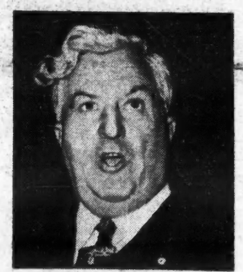
SEN. PAT McCARRAN Try the jumbo size

On Wednesday the Hobbs bill, providing indefinite imprisonment wit bail for deportable aliens whose home lands will not accept them, was up for action in the Senate under procedure requiring unanimous consent. It was requiring unanimous consent. It was blocked only by the objection of Sen. Leverett Saltonstall (R-Mass.) on the request of Sen. William Langer (R-N.D.), who was absent. The House passed the bill July 17. On Thursday, Sen. McCarran (D-Nev.) wrapped up into one big om-