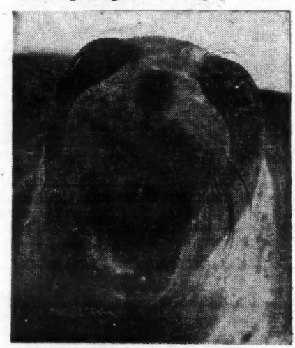
HAVE YOU HEARD?

BRITAIN IS WORRIED: Political re-BRITAIN IS WORRIED: Political re-percussions of the Chiang-MacArthur talks rang round the world. Pressure from Great Britain was a main factor behind Harriman's trip. Britain is alarmed that MacArthur will precipi-tate a war with China. Conservative and Labor MP's joined the press in attacking the general. One paper called