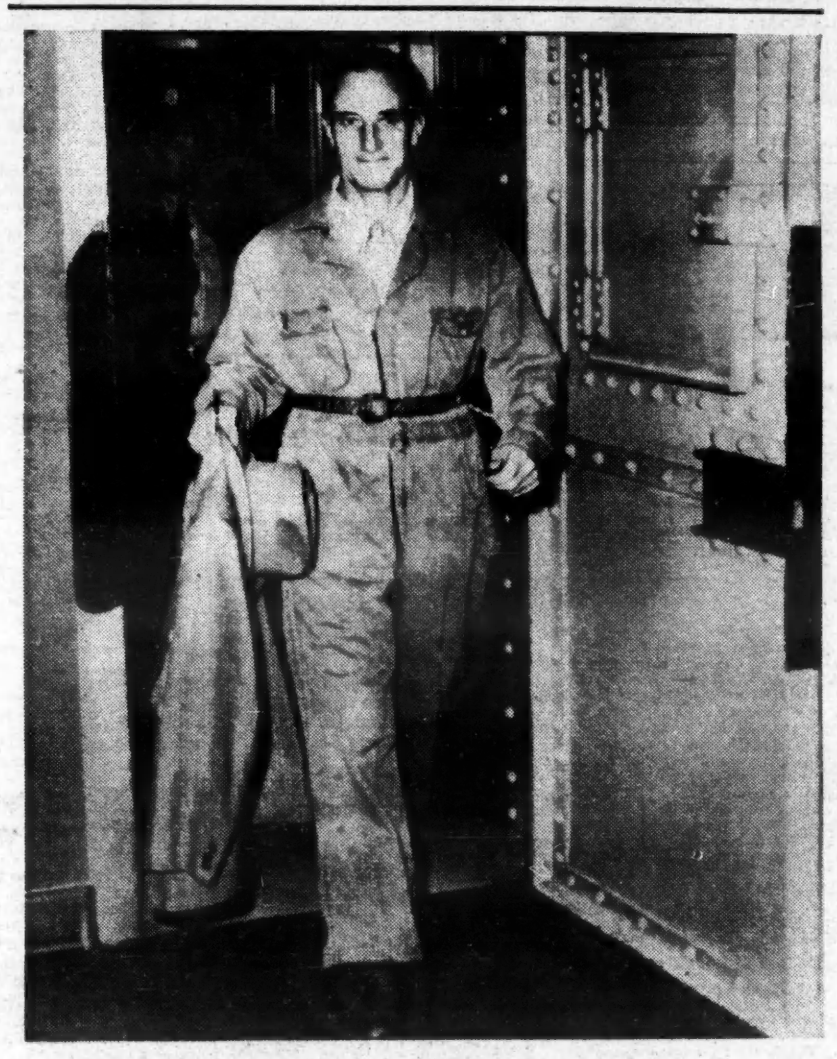
A defiant Harry Bridges goes to jail (See FREEDOMS roundup, page 8)