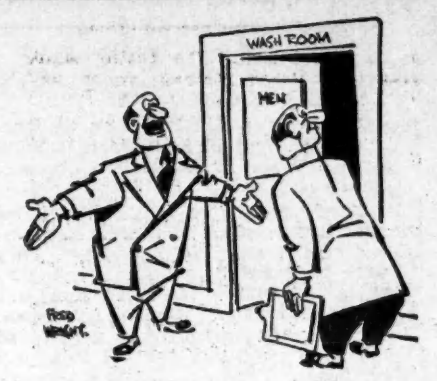
"Don't you know there's a war on? I want 10-cent pay machines installed."

LARDED POCKETS: Yet the Dept. of Agriculture said food stocks were ample and no increase in farm pro-duction is contemplated. Prices paid to duction is contemplated. Prices paid to farmers have been going steadily down, and the Dept. indicated July 23 they would not rise much, if at all, above the 1949 level as a result of the Korean war. But it admits speculation is rampant. A Commodity Exchange Authority report last month said price advances in the first four weeks of the Korean war ranged from 5% on corn to 41% on