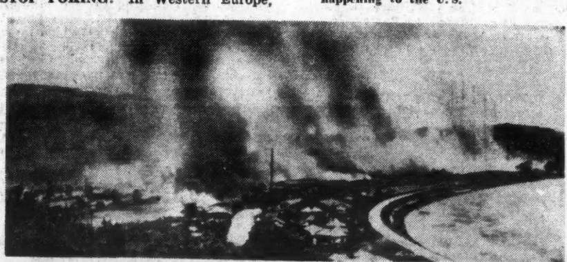
WESTERN KNOW-HOW COMES TO KOREA in smoke and flames after a U.S. raid

The kind of news you get in Guardian is priceless. Help our sub drive!