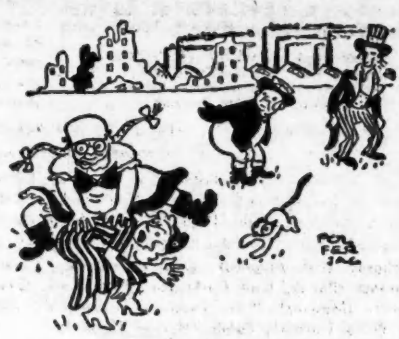
Canard Enchaine, Paris