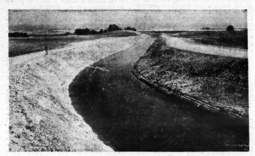
precious as blood. The Madera Canal, a small part of California's vast Central Valley Project, carries irrigation water t San Joaquin Valley. ater to rich but parched acres in

At present equipment is available which will distill 100,000 gallons of sea water a day at a cost of 55c per 1,000 gallons, which is far too expensive for irrigation and other purposes. But Chapman insists that if distilling plants could be built with 500 times this capacity and 50 times the efficiency, then the U.S. should never have to worry about water again. worry about water again.