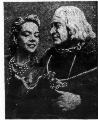
POLONIOUS DERWENT and OPHELIA The time is out of joint Hamlet, Act I, Box

His examiners had told him not to talk about his experience; he not only talked, but demanded explanations and an apology. Equity protested to