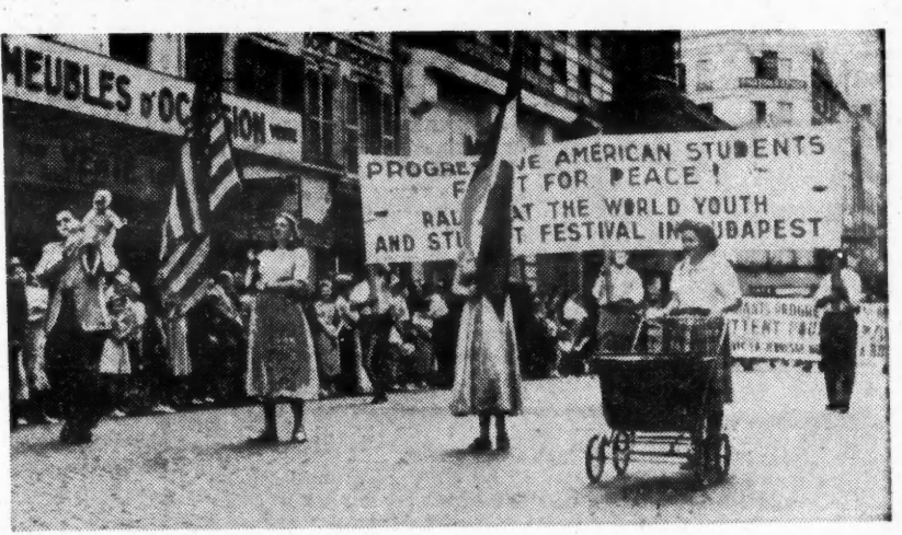
No longer the "innocents abroad," these young Americans know what they want and they said so in the Bastille Day parade in Paris July 14.

Such actions of the Nehru govern-Such actions of the Nehru government and the Congress Party are making them increasingly unpopular. The Congress Party evidently considers itself the government of India. Since Pandit Nehru is looked upon as the only liberal leader both in the party and the government, his acquiescence to such actions inevitably leads to popular demonstrations against him.