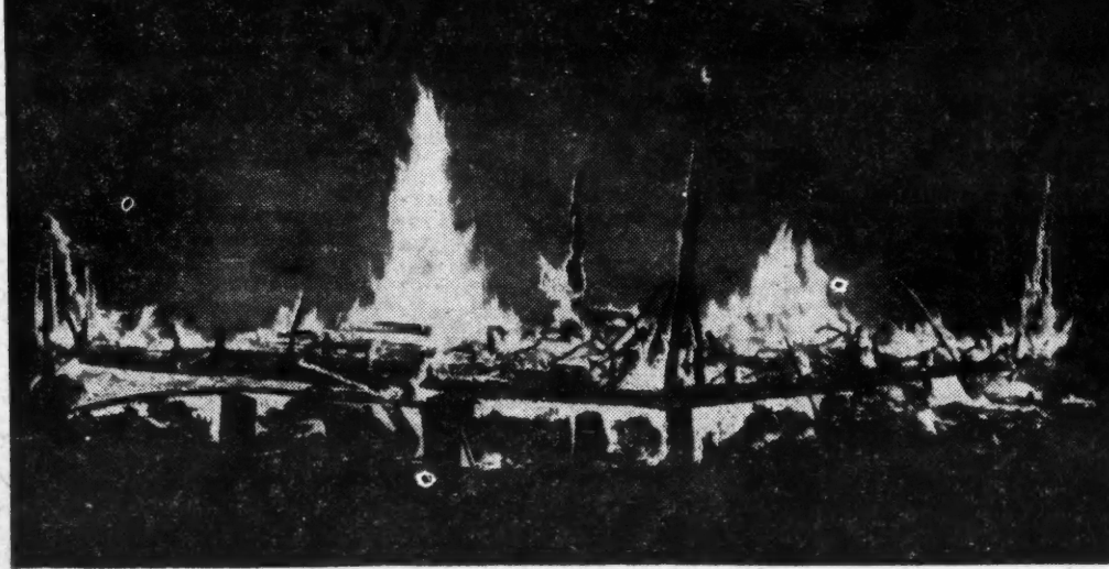
THIS IS GROVELAND, FLORIDA

Characterizing as a menace the House Committee on Un-American Activities. Demanding a N.Y. State investigation of police brutality against Negroes in N.Y. (To an NAACP press conference in Brooklyn, after the grand jury refused to indict a cop who shot a Negro to death in a traffic altercation, only three papers sent reporters: Daily Worker, Post, GUARDIAN.)