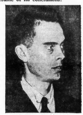
DR. GILBERT F. WHITE Peacefully in the same world

5. The probability that much of the present tension between the United States and the Soviet Union reflects the muby the other. 6. The improbability of overcoming this fear and attaining