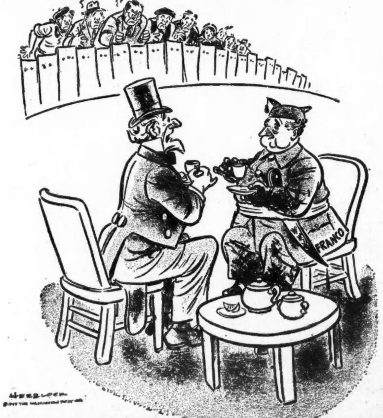
do you suppose it is that so many Europeans are turning communist?"

insisted he give absolution to the dead insisted he give absolution to the dead woman. The priest agreed—provided the red flag was removed. As soon as the ceremony (one of the sacraments denied to Communist Party members and fellow-travelers under the Pope's new decree) was completed, the priest departed. Mourners and relatives promptly brought out their red flags and escorted the hearse to the cemetery with banners high. with banners high.