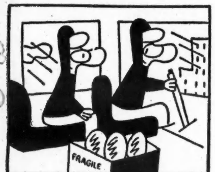
Franc-Tireur, Paris "America is making new atom bombs, the papers say."

Western Pennsylvania a From GUARDIAN correspondent reported that two-thirds of the labor force is out of work or on part time. "They are making the insane asylum at Torrance bigger this summer," he writes.