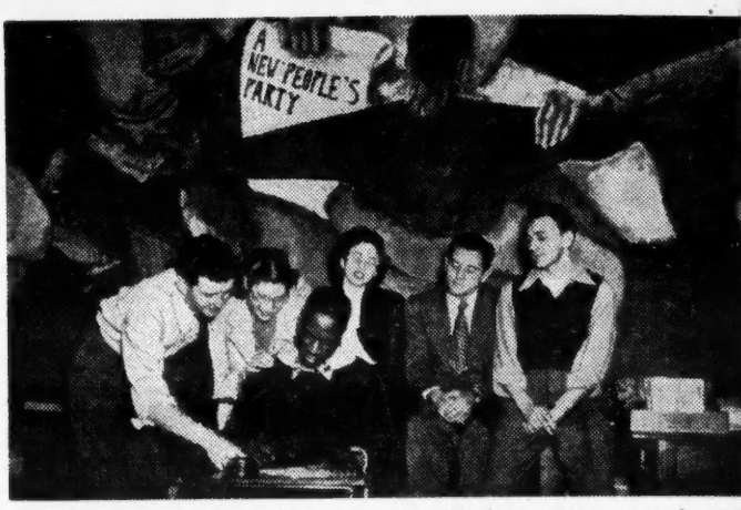
The Executive Committee of the Eastern Pennsylvania YP The Executive Committee of the Eastern Frankylvania Ir chapter writes a letter to the youth of Leningrad. The letter said, in part: "The American youth desire peace and goodwill. Jobs, education, homes—not war—are our needs and united in friendship and cooperation with Soviet youth and youth all over the world, these will become a reality."

IN NEW YORK, the YP is help-IN NEW YORK, the YP is neiping out striking Tricamp Corp. hosiery workers. The group is collecting food, teaching German*and Spanish-speaking strikers English and helping on picket lines. Several workers have been joining YP every day.