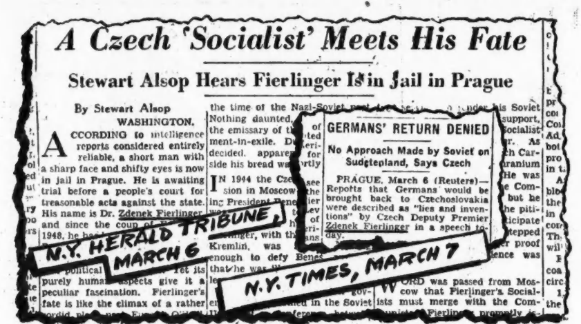
According to intelligence reports considered even more reliable than Stewart Alsop's, the N.Y. Herald Tribune's face is the color of a Cardinal's hat. See above how it got that way.

that and a commitment to war was still obscure. The roundabout language was designed to satisfy the U.S. Con-stitution that only Congress can com-mit the country to war.