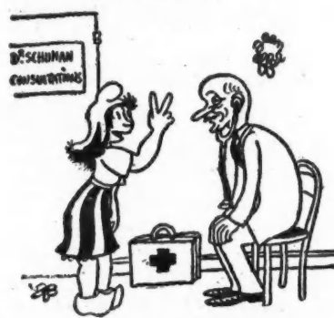
Canard Enchaine, e: "It hurts now when I make this movement. . . ."