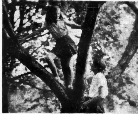
The reviewer and her daughter

We seem to pretend that a city for a child is only a phase that will pass. Our own memo-ries of trees and swimming holes are nostalgic; we know how much they are woven into our personality fabric. But we have not provided