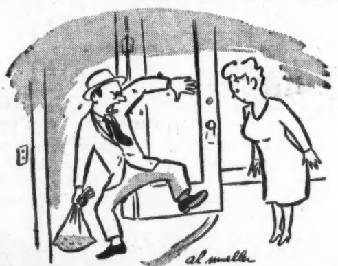
"Wise guy bus driver-I gave him a $20 bill!"

A PROGRAM of cultural exchanges between the U.S. and A PROGRAM of cultural exchanges between the U.S. and countries of Europe is being launched by the National Council of the Arts, Sciences and Professions. It will be introduced in a series of symposiums sponsored by the New York State Council of ASP. The first will be held on the evening of Dec. 18 at the Lincoln Steffens Lodge,, IWO, 77 Fifth Av., N.Y. Admission is $1. A film on the silk screen process of poster and picture making will be a feature. The National Council of the ASP is calling on the artists, scientists and professionals of all regions of the country to participate in the program. Further details can be obtained from Paul Strand, ASP, Hotel Iriquois, 43 W. 44th St., N.Y.C.