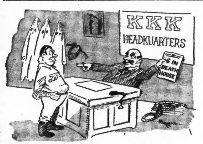
"Send an organizer up to Trenton"

U.S. Senetor, is chairmon of the National Committee of the Progressive Party.