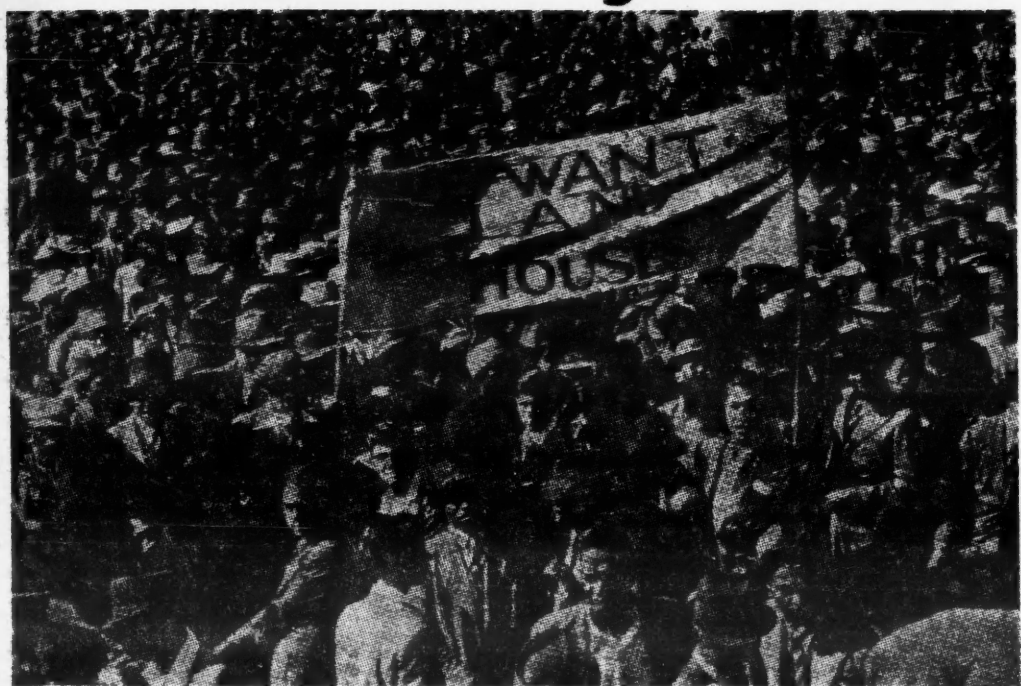
South Africans demonstrating for land on which they can build their own houses,

WHAT is the reaction of Black Africa to European schemes for exploiting their land? Are the natives simply stolid and dumb, submitting without protest or comprehension of their plight?