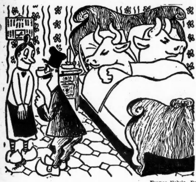
France Hebdo, Paris