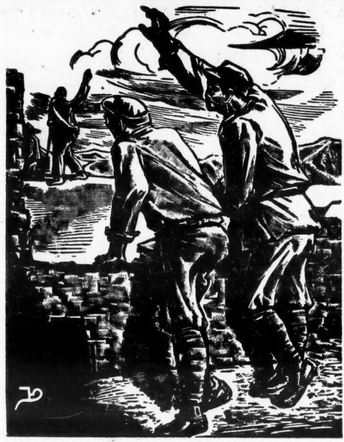
Waving Goodbye (Artist Unknown)

in Berlin: World-famous circus in Hagen, k, who captured wild s in Sumarra, Borneo and Indian , sold millions of dollars' worth Barnum and 100 zoos throughout