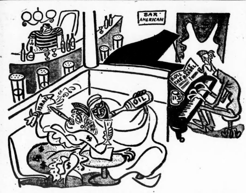
"Boy, is she going to have a hangover tomorrow!"

Reports of Armistice Day observance in Paris high-lighted a "brawl" with police "that the Communists had evidently instigated." Old-fashioned folk recalled that "the Communists," above all other Frenchmen, faced torture and. death rather than yield their country to Hitler.