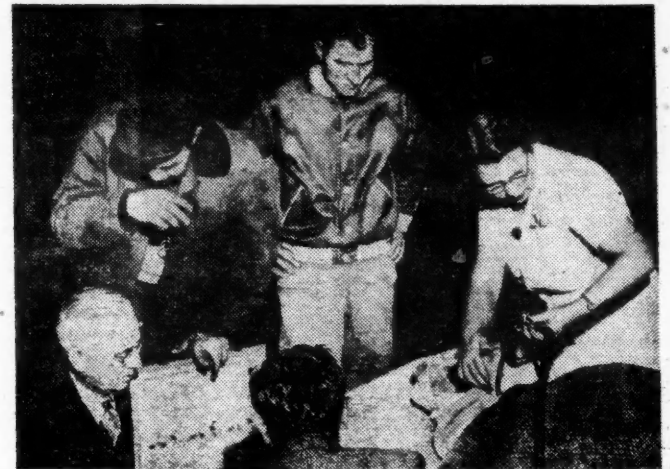
Oxygen treatment being given to victims of the death-dealing g in Donora, Pa.

American health is bad. Ask the Defense Department, which seems to be running most things in the U.S. today. Four in ten. World War II draftees were rejected as physically unfit. Twelve per cent of them were mental cases. On Nov 2 draft boards in ten of America's largest cities reported they had turned down 72 per cent of all 24 and 25 year-olds as unfit. Every second one of these was a neurotic.