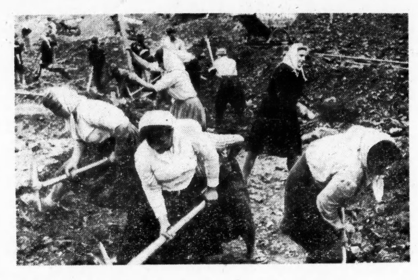
A volunteer brigade of girls helping to build a Youth Railroad in Yugoslavia

GUNS CAN'T READ. This year, International Students Day, in addition to highlighting the efforts of students to help themselves and to win a place in deciding the future of their countries,