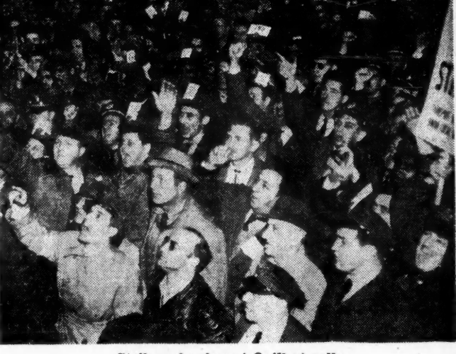
Strikers jeering at Quill at rally.

Mayor O'Dwyer, his sympathetic complacency shattered, reversed himself and announced