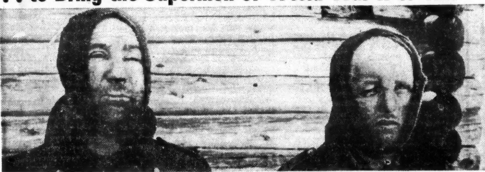
German soldiers after the Nazi debacle at Stalingrad.

.. to Bring the Supermen of World War II to This