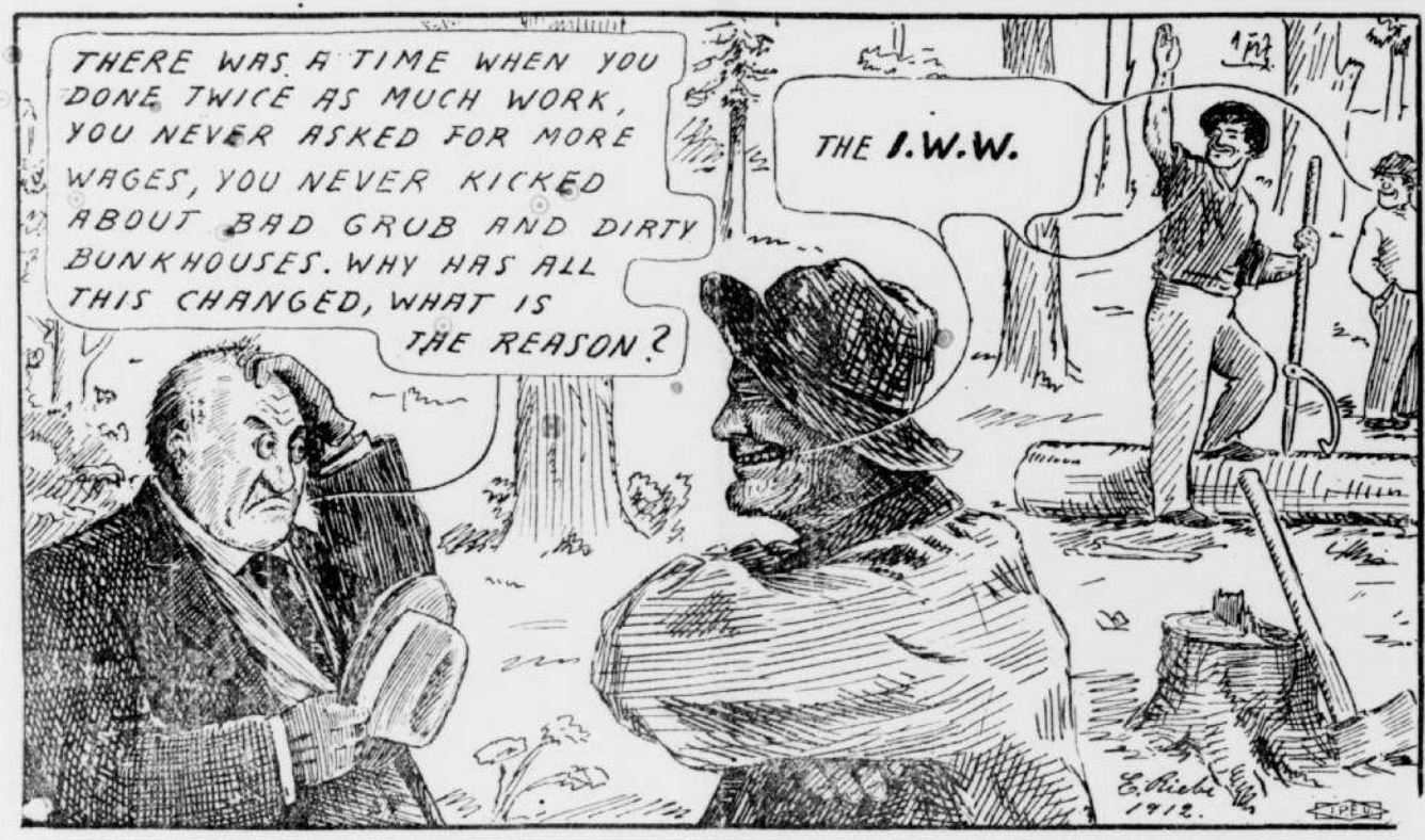
THE MISSIONARIES OF THE NEW AGE PREACHING TO THE LOST RACE OF LUMBER KINGS.

De Ridder, La., Mar. 10, 1913. On March the 3rd, 1913, I came into Merryville, La., with my brother, ex-