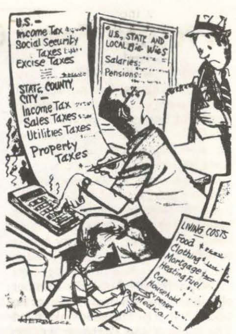
"You want to know about the taxpayer revolt? It began with a simple adding machine..."