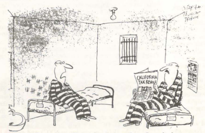
'I guess I was living ahead of my times. I revolted against taxes three years ago'

In responding to the tax revolt sparked by Proposition 13, the Left must not only be concerned with relieving the tax burden imposed on low and middle income people by inequitable taxes. We must also assure that there is sufficient revenue to provide these people with vitally needed services. There is no point in giving any family $100 in taxes if to do so requires reducing their police and fire protection, increasing their public transportation costs and denying their children the educational opportunities needed for a better life. |