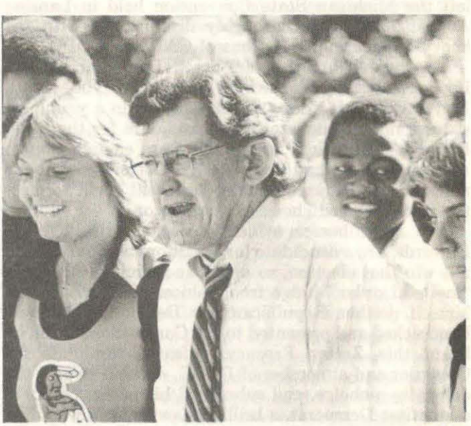
Zoltan Ferency and his supporters waged a respectable battle for the Democratic nomination for governor in the Michigan primary.