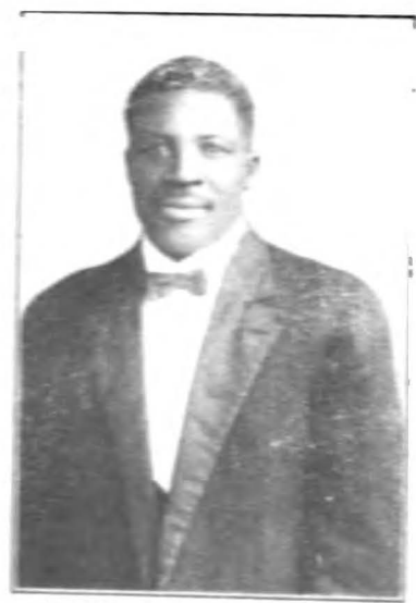
LEON WALTON YOUNG, ESQ. Member of the Legislative Assembly of the Bahamas; re-elected senior member for the Eastern District of Nassau. (See article.)