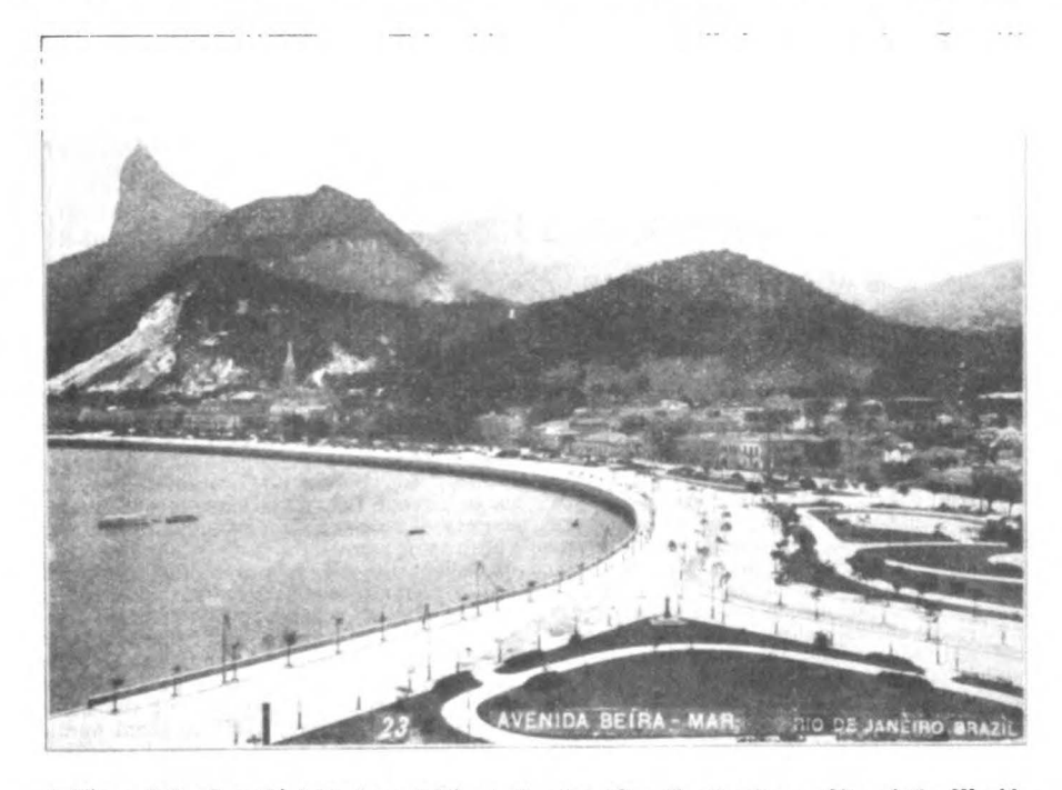
A Viczo of the Beautiful Harbor of Rio de Janeiro (Brazil), the Queen City of the World.

The livestock industry of Brazil has had a phenomenal growth. The exports of animal products from Brazil have increased in volume over 300 per cent, since 1913. Brazil is one of the leading cattle countries in the world and has many important packing houses, some of