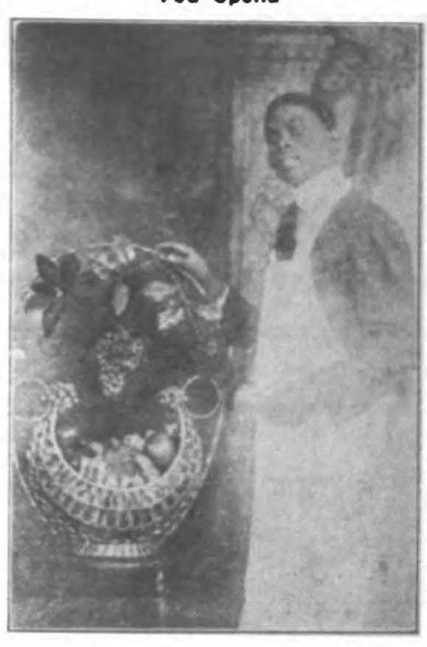
Spend Your Money Where It Can Go Farthest

GREETINGS OF THE SEASON! Always Get 100 Cents in Value for Each Dollar You Spend