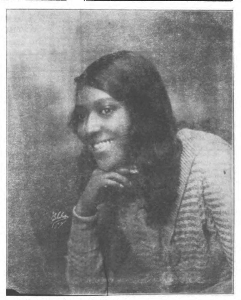
Please Mention The Crusader