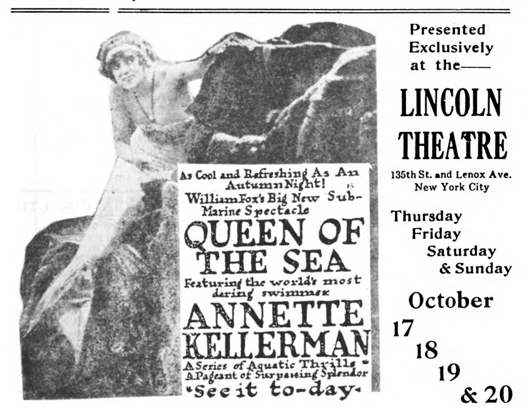
Mention The Crusader

Remember this when the next white man tells you what terrors his rapacious intervention in African affairs saved the natives.