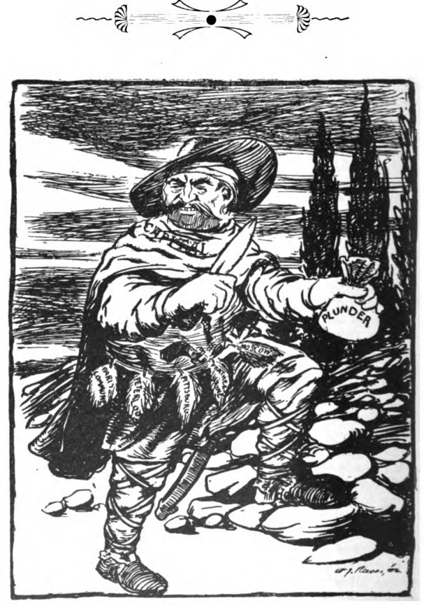
The King of Brigands