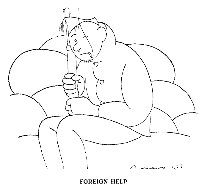
Beans! They think we shoot with beans!

When Lenin in Russia asked Leon Trotsky to take over the War Commissariat; the bolshevick situation was desperate. They scarcely even had under their control the territory lying between Moscow and Petrograd. There were counter-revolutionary governments in the north, menancing the old capital. In Archangel, the Ukraine, Siberia and the Caucasus, the whitew troops were advancing on Moscow irresistibly; they could count on the support of the whole of imperialist officialdom. France, England, Japan and the United States gave them war material