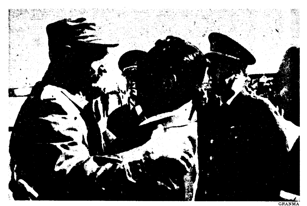
Chilean armed forces chiefs witness Allende-Castro reunion, November 1971.

Party and left Christian Democrats. Since the 1970 elections both the Radicals and left Christian Democrats have had splits, with pro-UP sections moving leftward and even claiming to support socialism. But the essence of the Popular Unity as a bloc with a section of the bourgeoisie was not changed. The UP government from the beginning rested on a tacit agreement with the dominant bourgeois party, the Christian Democrats, without whose votes Allende could not get a single one of his reforms passed by Congress. More recently as the rightist attack on the government sharpened, the role of chief guarantor of the interests of the bourgeoisie within the government was taken over by the military ministers.