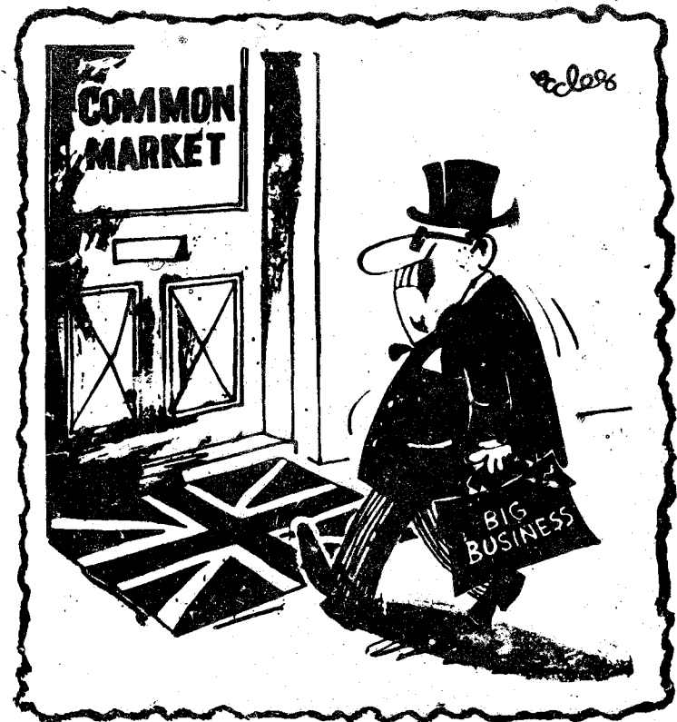
The real issue as the 'Morning Star' sees it: big business trampling on 'our' flag.

Of course it is true that the most important sections of the British capitalist class want Britain to stay in the EEC (though that could change with an upsurge of protectionism in the trough of a world crisis). But should Marxists always choose our policy according to what is worst for the capitalist class? We might do, if we thought socialism would come through capitalism simply collapsing under the weight of its own crisis. But capitalism will always continue to drag itself through the chaos, heaping the worst miseries on the working class, until that class organises itself and acts, consciously, to replace capitalism with a workers'