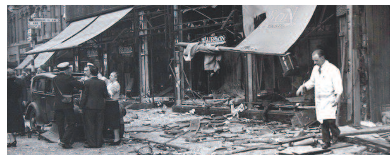
The aftermath of an IRA bombing in Coventry in 1939

ation when the demolition of the barricades may be needed in the interests of British capital itself". Now according to his logic, when the troops did start taking down the barricades (that very same week) then the first stage — troops plus Catholics v. Paisleyites — had finished. Shouldn't IS then have re-incorporated the demand for troops to go?