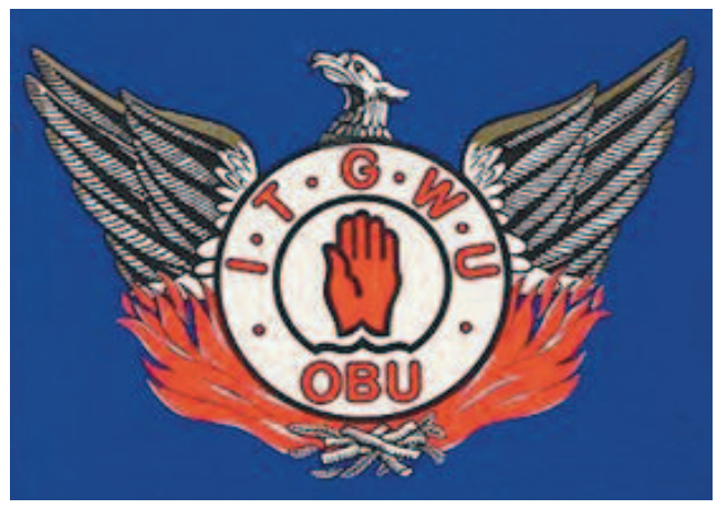
Emblem of the Irish Transport and General workers union

If I credit Norton with this grandiose strategy it is because he is the arch-Machiavelli in the government ranks. The capitalist ministers are universally hated by the working class, and unless Norton can circumvent the growing critical mood of the workers the government's days are numbered.