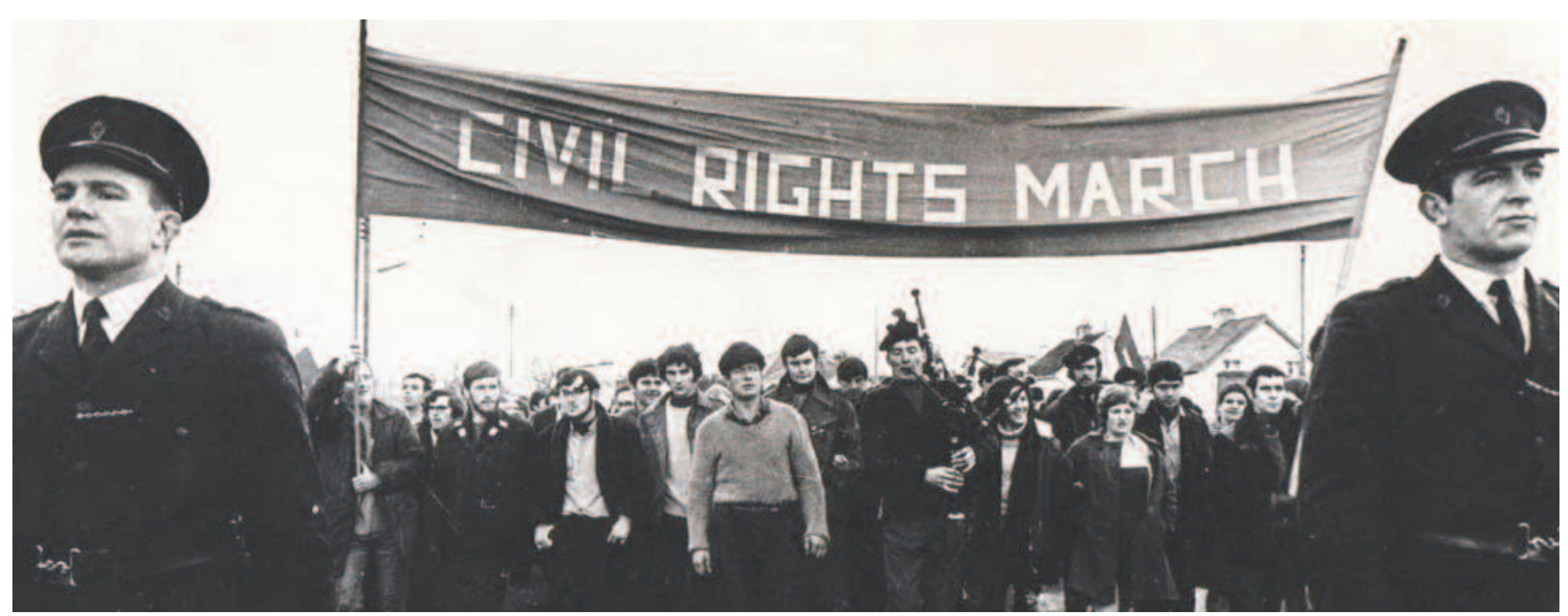
Burntollet march in 1968