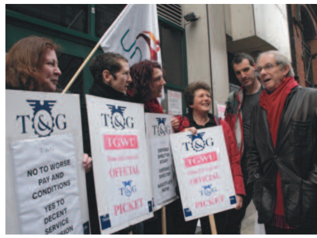
Ken Loach visiting Shelter picket lines in 2008

To win NHS or council contracts, "not for profit" employers cut back on rates of pay and training for their staff. Some employers do this before bidding for a contract, others do it after winning a contract. This "race to the bottom" means different employers seek to