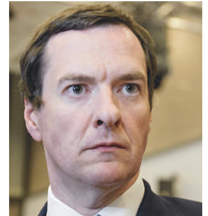
Osborne: it's going so well we will have to make cuts

Trades Councils and the like. But they are patchy, and tend to be more vehicles for occasional public meetings than for day-to-day organising.