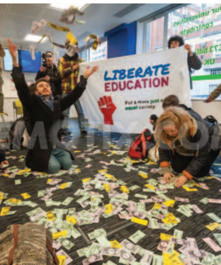
Free education demonstrations at Chichester and Bath, and an occupation of Universities UK in London