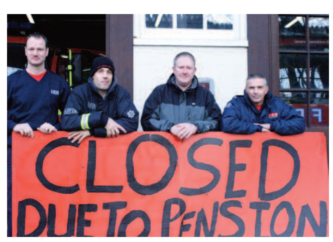
Firefighters picketing Euston fire station

The only visible dissent from the FBU leadership's strategy is from some London, Essex and the North West officials, who have organised meetings calling for a more hard-hitting programme of strikes". However they are not clear about the duration of further strikes, with some pushing for two days and others for