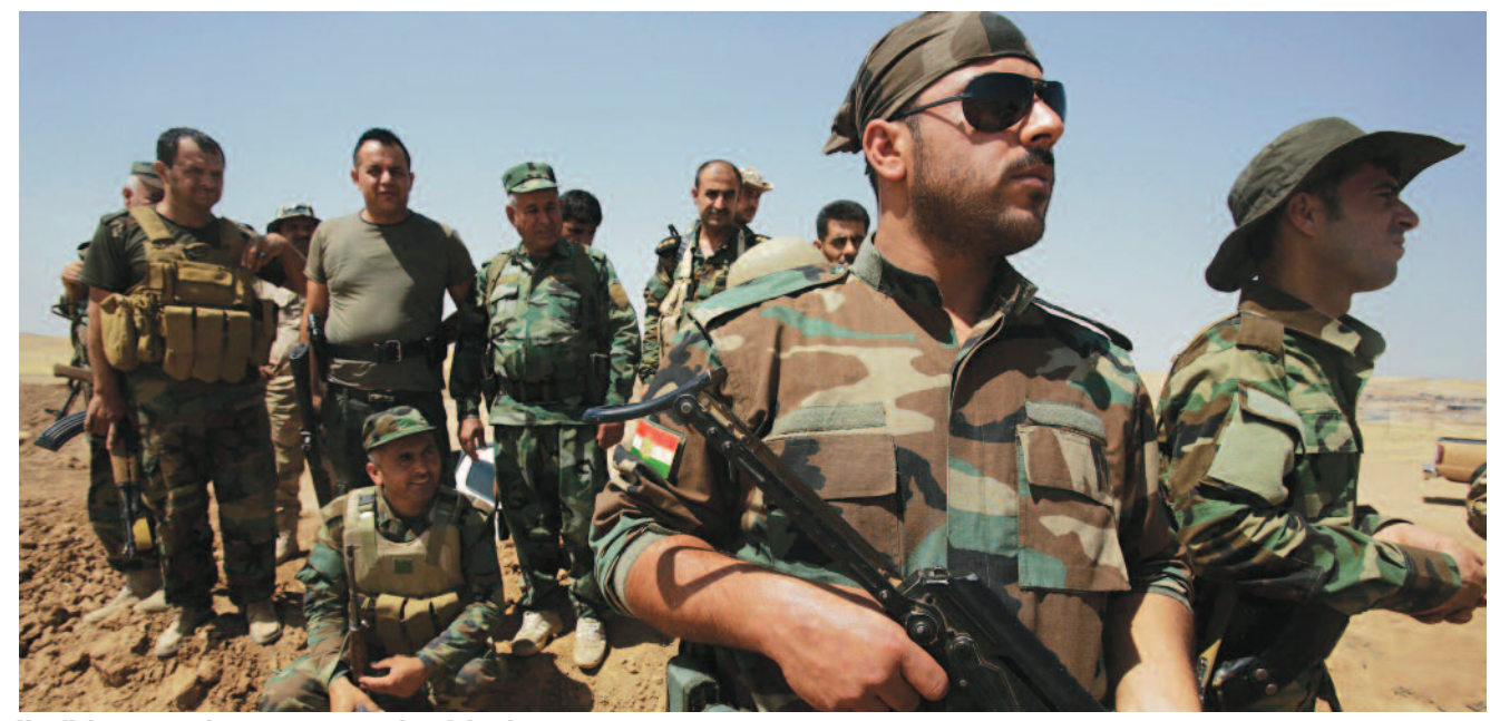
Kurdish troops: slow progress against Islamists