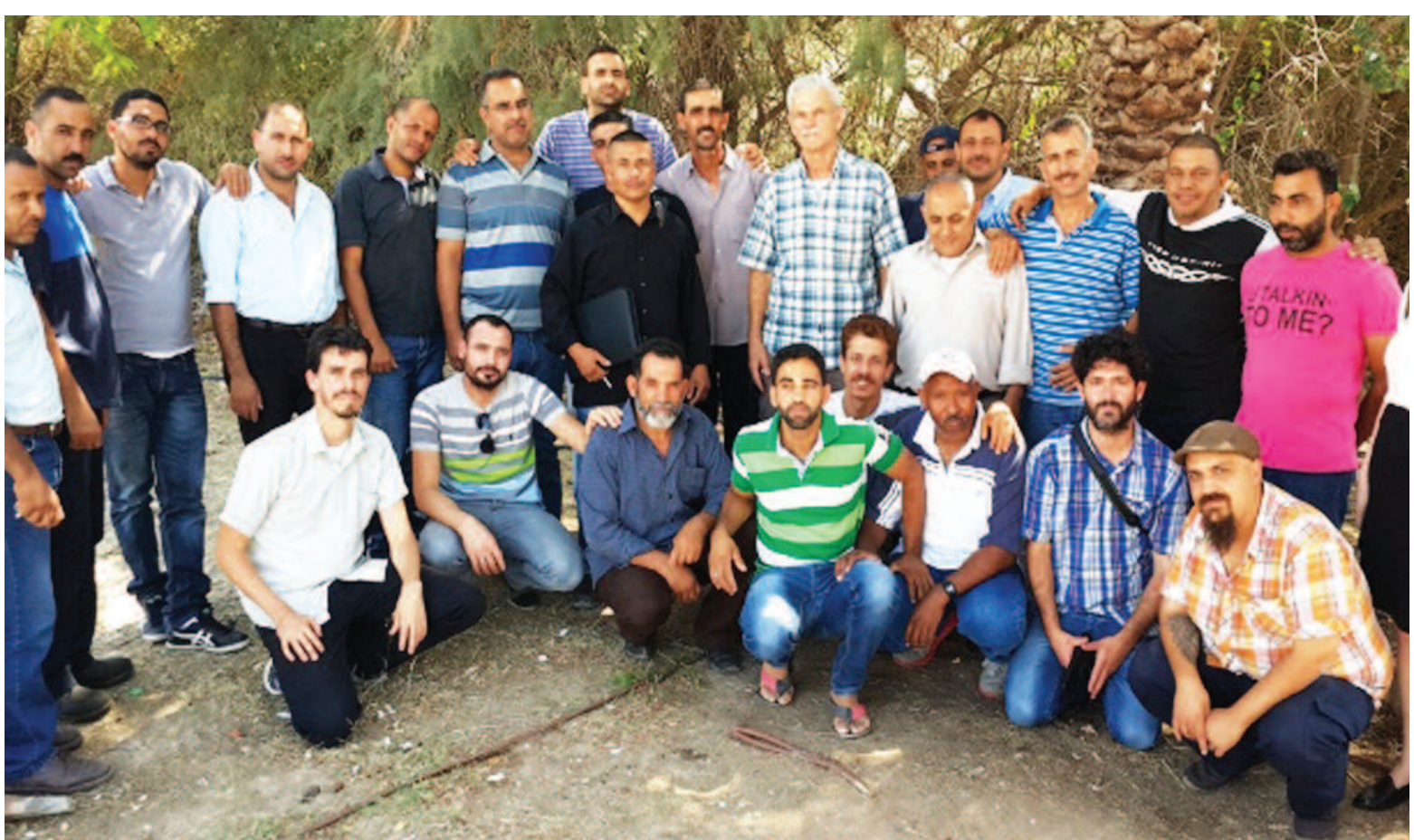
Palestinian workers fighting for WAC-MAAN union recognition at Zafarty Garage, East Jerusalem, 25 August