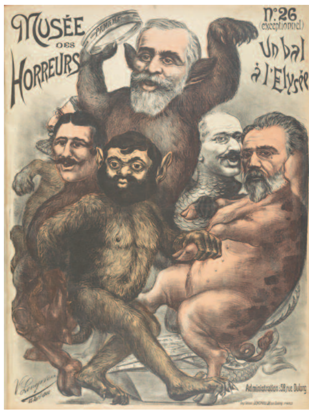
A right wing magazine caricatures Zola (right), Dreyfus (second from right) and others in the "Affair"

"The subjects that always interested me most were Socialism and the Jewish question. It is, therefore, natural that I should look upon the author of Germinal and the defender of Drevfus with deep admiration. But cher maitre, I cannot conceal the fact that your Rougon-Macquart series and Trois Villes do not contain a single Jewish character worthy of our sympathy."