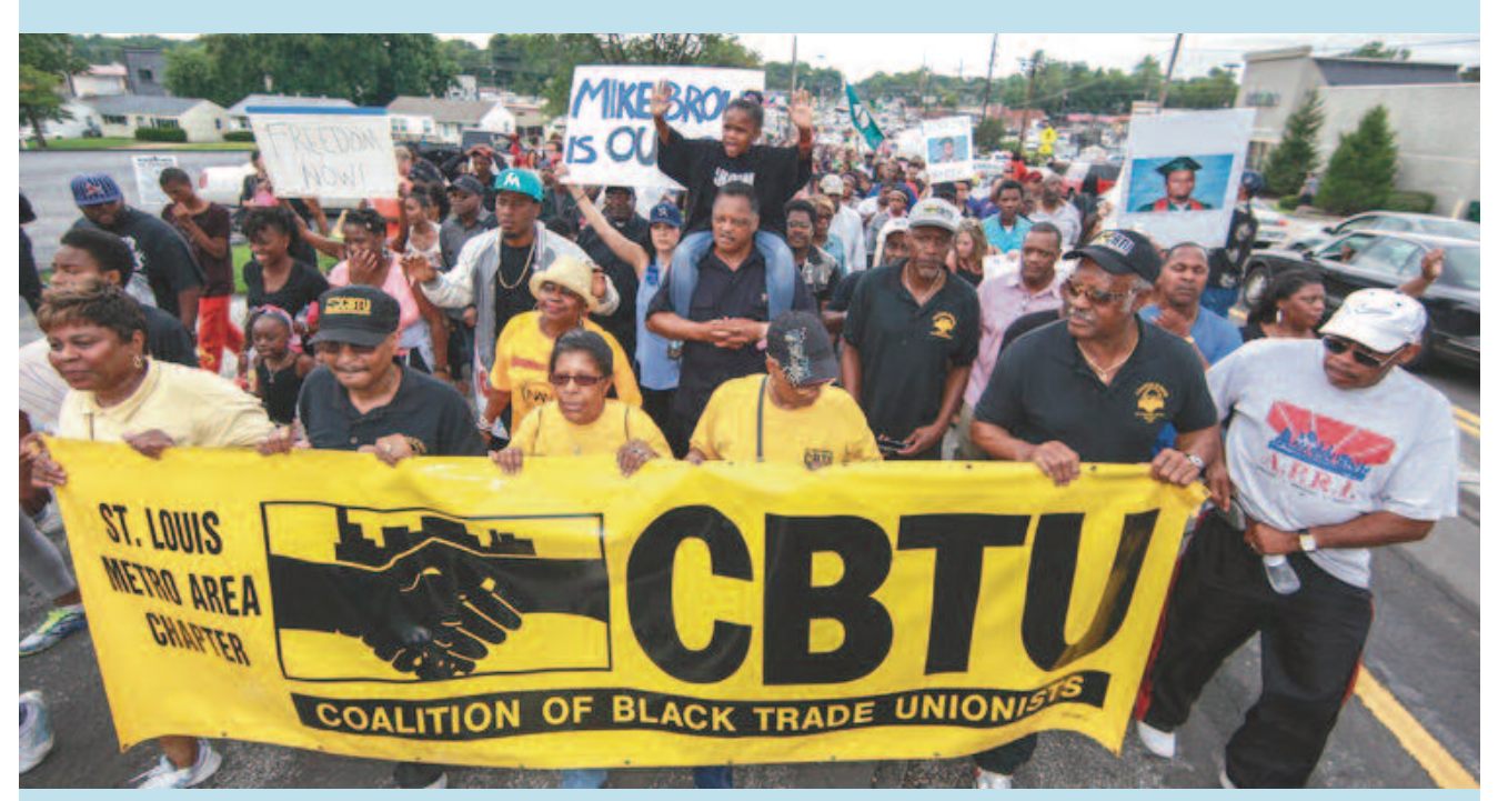
Coalition of Black Trade Unionists march in Ferguson