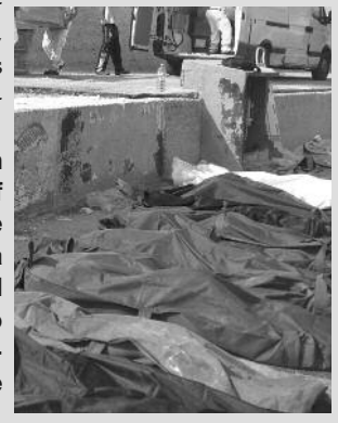
Bodies of refugees

When will the left begin to challenge this state of affairs? Until it does the prospects for building a serious working class led movement of opposition to a society mired in continual crisis is, sadly, more and more distant.