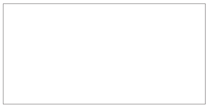
2002: when NUS did a very small amount of campaigning. Now it does pretty much none