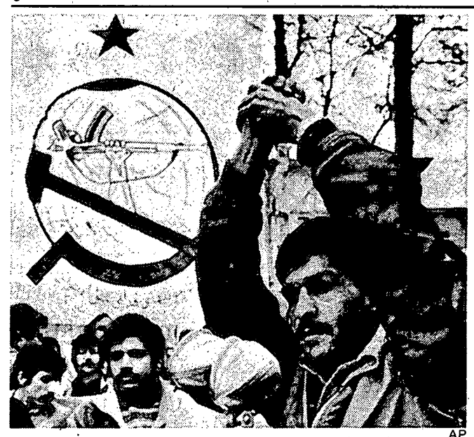
Fedayeen guerrillas asked for role in Islamic state at Teheran University rally (above). Today they rot in Khomeini's jails.

fundamental historic fact imposes a particular program, strategy and tactics on proletarian revolutionaries in the colonial world. In these countries the struggle for democratic rights and against feudal reaction is inextricably bound up with the struggle against foreign domination. Popular movements against domestic reaction and imperialist domination are often led by bourgeois nationalists.