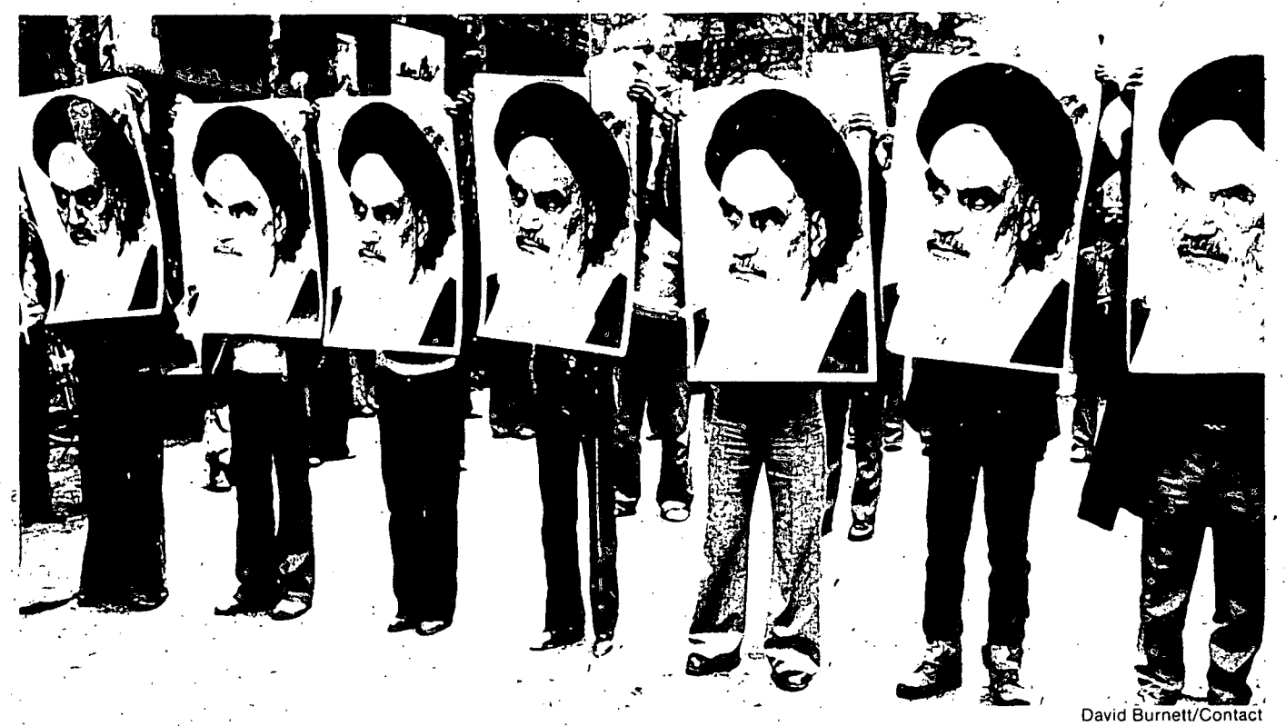
Behind Khomeini stood not only mullahs and merchants but fake-left opportunists.

them immune to reactionary mobilizations. The petty merchants and lumpenproletarians of Germany or France may sometimes do bad things, but not so their Iranian or Indian counterparts. We grant that Weimar Germany was a very different kind of society from the shah's Iran. But early twentieth-century tsarist Russia was not. As an extreme instance of combined and uneven development, no country in the contemporary world so resembles the Russia which produced the Bolshevik Revolution as does Iran.