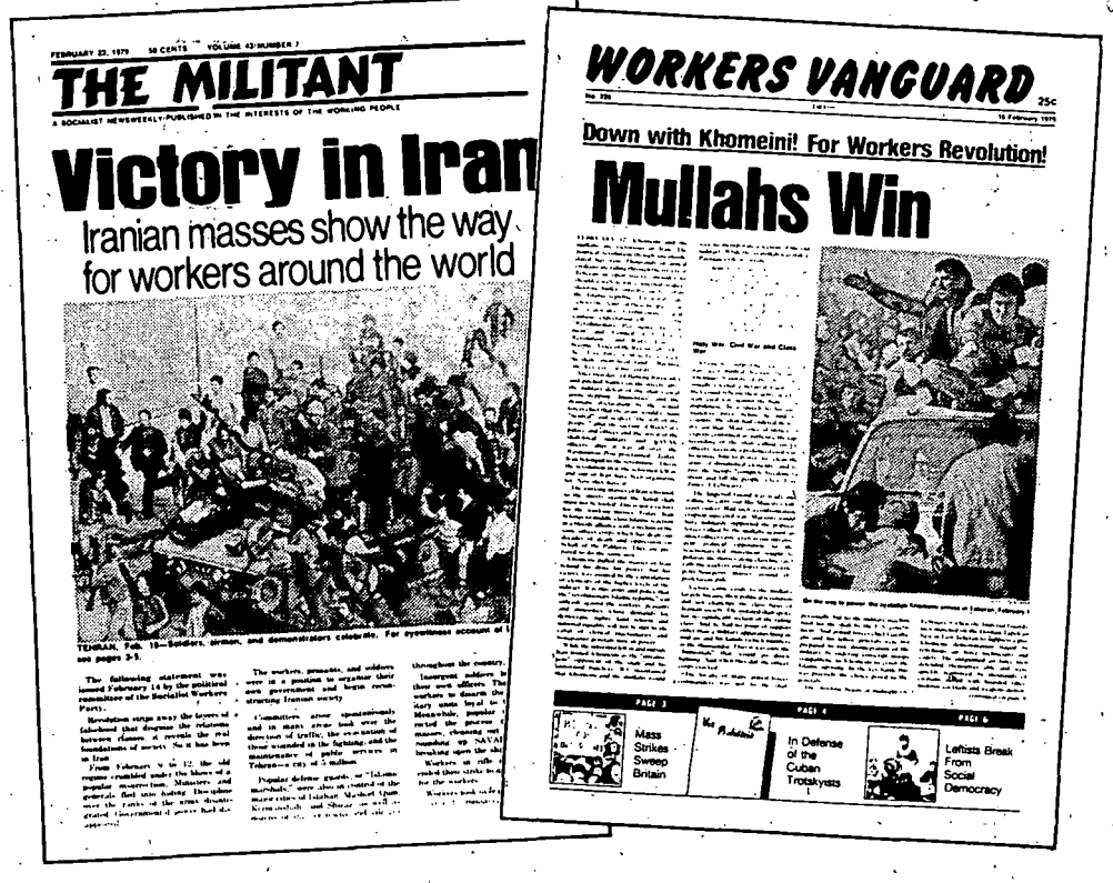
The SWP stood with the mullahs; the Spartacist League stood with the Iranian proletariat.

What was lacking was a revolutionary working-class leadership organized around a program of democratic and socialist demands capable of winning the support of the poor peasants, the national minorities, the militant women: for the abolition of the privileges of the clergy and the establishment of a democratic and secular constituent assembly; self-determination for national minorities; land to the tiller; equal legal rights for women; for a workers and peasants government. What was needed was a Bolshevik leadership to mobilize the strategically placed oil workers whose strikes helped topple the shah but who mainly stood aloof from Khomeini's religious mobilizations. The emergence of a class-conscious proletarian pole vying for power in its own right could have split away from