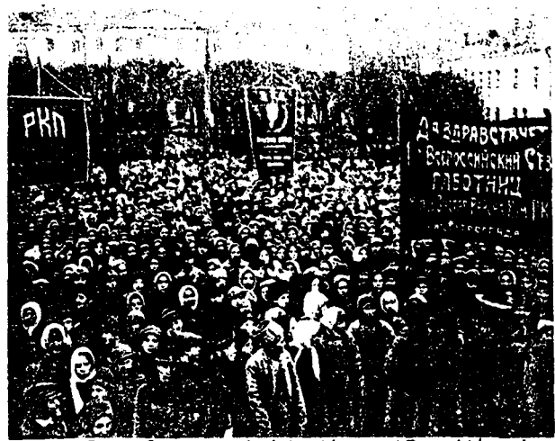
first All-Russian Conference of Working Women and Peasant Women in -1918. Delegates to the Conference march toward Convention Hall. WOMEN AND REVOLUTION

In order to hasten the hour of the decisive conflict between the proletariat and the degenerating bourgeois world, the working class must adhere to the firm and